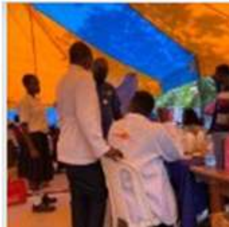
Healthcare students assist with medical mission care