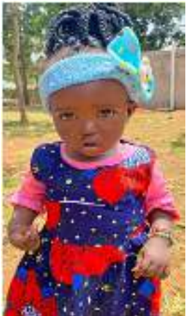
Child's first doctor visit