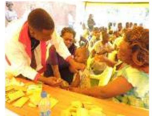
Medical mission clinic provides free immunizations