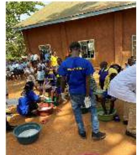
Chiggers are common health problem for Kenyan children