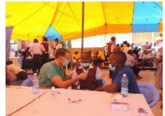
Primary care for Kakamega students