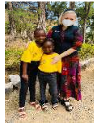
Medical mission trips bring specialty care to Kakamega children