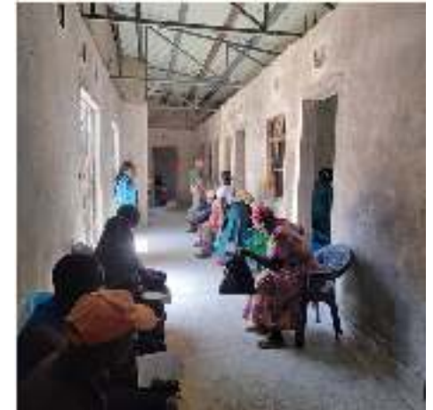
Nebraska Rotarians conduct Vision Care clinic in 2022