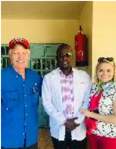
Visiting Kakamega County General Hospital

Visiting American physicians and nurses will provide specialty care in ophthalmology, optometry, family medicine, OB-GYN, and internal medicine.