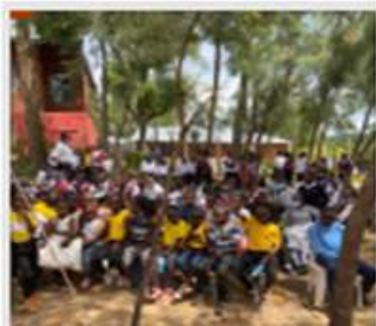
School children waiting to receive typhoid vaccinations and basic medication

Kakamega County, in western Kenya, is a remote and medically underserved region, and residents of the village of Shikunga have no place to obtain basic medical care and medicine. Kenya has a national health insurance program, but participation requires a steady job and income, putting it out of reach for most people. This causes people to seek charity treatment at the national and regional hospitals, which become backlogged and overwhelmed.