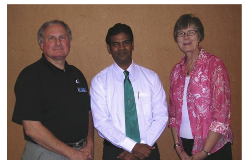
Manhattan New Members Pictured above L-R: