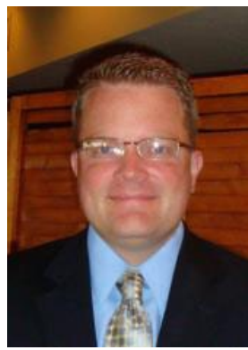
Lawrence Jayhawk New Members L-R: