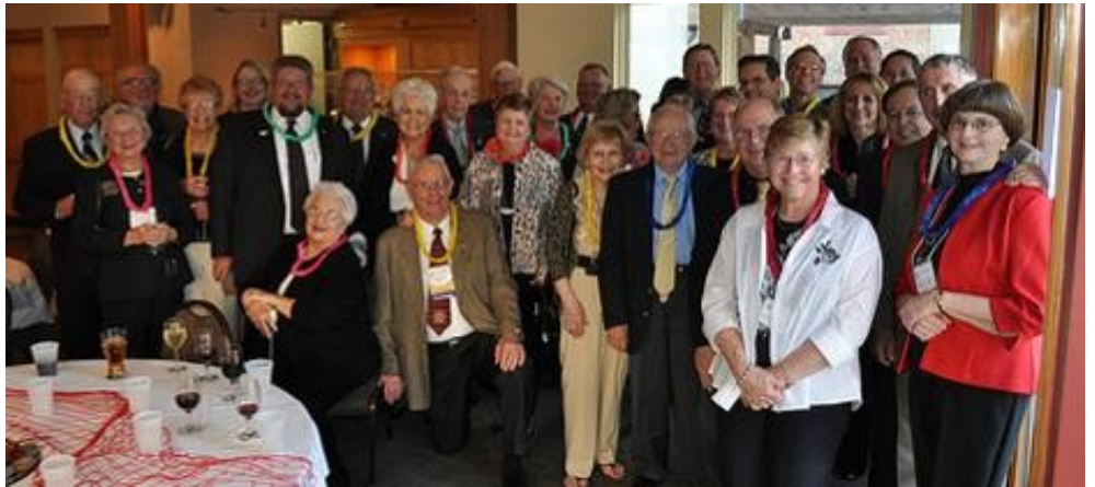
Past District Governors Banquet