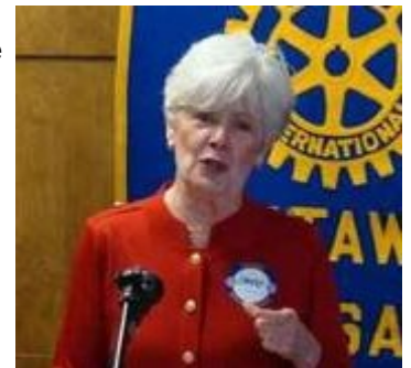
State Insurance Commissioner Sandy Praeger