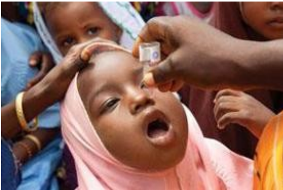
Girl receives polio drop in the Fulani settlement in Mashakeri Village (Kebbi, Nigeria, 2011)

In 2012 we need to keep India and all the other places that are polio free from getting re-infected. The biggest focus for 2012 will be improving the polio vaccination campaigns in Nigeria, Chad, the Democratic Republic of Congo, Afghanistan, and Pakistan. I recently visited Chad and Nigeria to meet with leaders there, and it's clear that we have high-level political support. Still, deploying high-quality vaccination teams and educating parents so that every single child is vaccinated will take a lot of work. In Nigeria our biggest problems are low-quality campaigns and the fact that some parents don't trust that the vaccine is safe. In Pakistan these problems are compounded by the security situation.