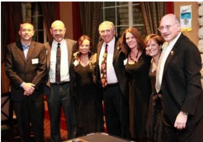
New repeat/multiple Paul Harris Fellow's (since the November Foundation Banquet) in the Leawood Rotary Club who were able to attend the Anniversary Dinner.