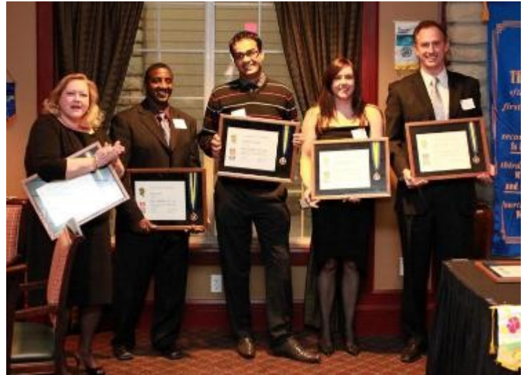
First time new Paul Harris Fellow's in Leawood Rotary Club who were able to attend the Anniversary Dinner.