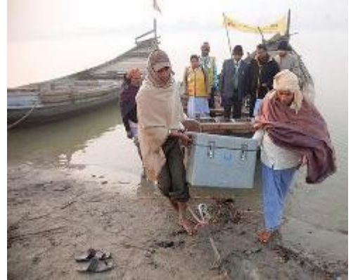
Polio vaccinators crossing the Ganges River on the last day of the polio campaign (Bihar,

Now India has reached a huge milestone. The country had only one case in 2011, which was recorded on January 13 in West Bengal. So on January 13, 2012, India celebrated its first year of being polio free. The challenge in India was mind-boggling. It's hard to imagine how you would design a polio campaign that reached every Indian child. More than a billion people live in the country. Massive numbers of families migrate constantly to find work. One of the largest states, Bihar, is flood-prone. In some cases, the vaccine didn't work as well as it had in other parts of the world, probably because of malnourishment, diarrhea, and other illnesses. But the government kept raising awareness and improving the quality of its campaigns, even in the toughest locations. The Indian government deserves special credit for this achievement.