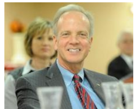
US Senator Jerry Moran attended a meeting in February as a "make-up" meeting for his club.