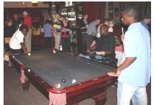
Fun for all!