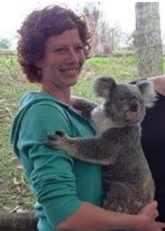
My future as a mother!

For a “marvelous” glimpse into life in Australia— CLICK HERE! Summer's blog is a FUN read, with GREAT pictures. Some of the highlights to check out: