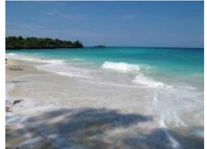
Beach on Chumbe Island, Zanzibar