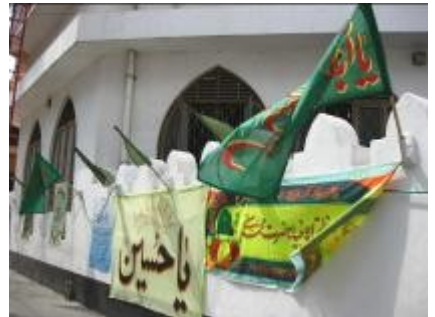
Mosque in downtown Dar es Salaam for the Saba Saba holiday.

Another highlight was my weekend trip to Zanzibar. I went snorkeling in a reef in a protected marine reserve; just when you thought you had seen every color more would come up. It was affiliated with an ecolodge that runs on solar power and uses filtered rainwater for the shower and tap. In Stone Town, I saw a famous historical slave market and beautiful whitewashed architecture, and drank Arabic coffee.