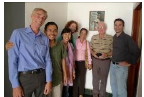
Lunch with Phnom Penh Metro Rotary Club