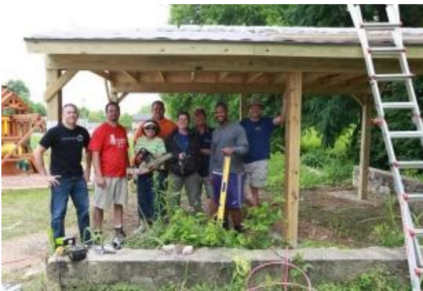
Left: In May the club participated in a workday at Hillcrest Transitional Housing. Members assisted in finishing construction on an equipment shed and other maintenance projects around the grounds.