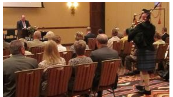
Sunday Morning Memorial Service