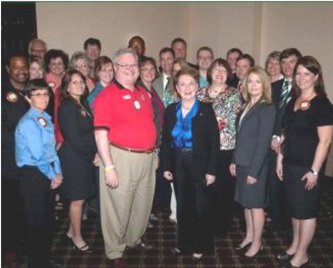
The club initiated its first class of RED BADGE members and mentors. The celebrates bringing in 32 new members this year-to-date.