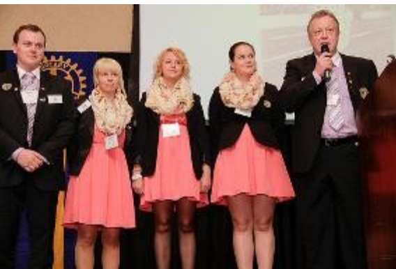
Top Picture: Group Study Exchange Team from Finland.