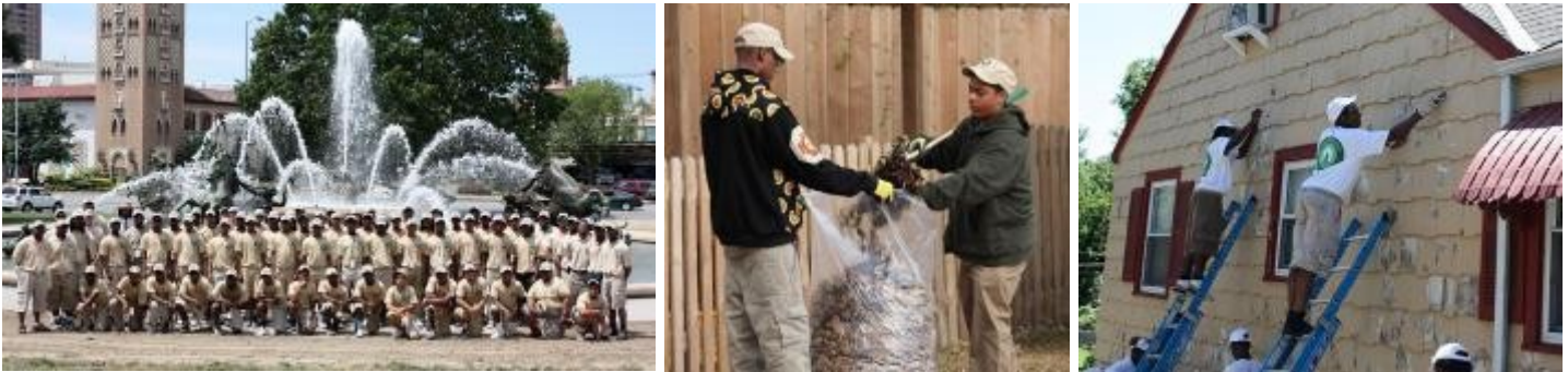
Pictured above: Photos from the Urban Rangers Corps, an organization supported by the Leawood Rotary Club. The Corps' mission is to develop at-risk youth from economically distressed neighborhoods by delivering access to personal career counseling and exposure to developmental experiences. Left Picture: Urban Ranger Corps at the Plaza Fountain. Center: Rangers cleaning up the grounds for local nursing home. Right Picture: Urban Rangers painting a house for a low-income home owner.