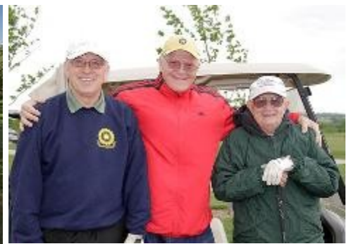
The District Conference kicked off with the Friday District 5710 Golf Tournament. Keeping with tradition, it was cold and rainy!!