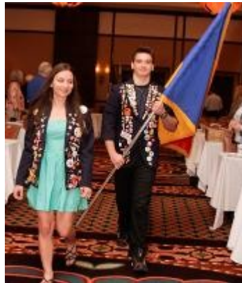
Inbound Youth Exchange Students presenting flags from their countries in the opening ceremony Saturday morning.