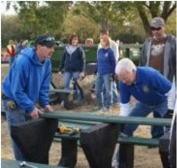
President Ed Coulter helping to assemble one of the picnic tables.

MAKE A DIFFERENCE DAY NATIONAL DAY OF DOING GOOD