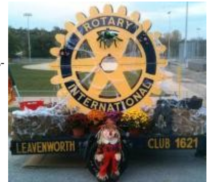
The club's Rotary Wheel!