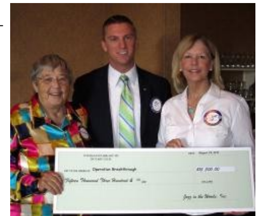
Operation Breakthrough receiving a check for $15,300.