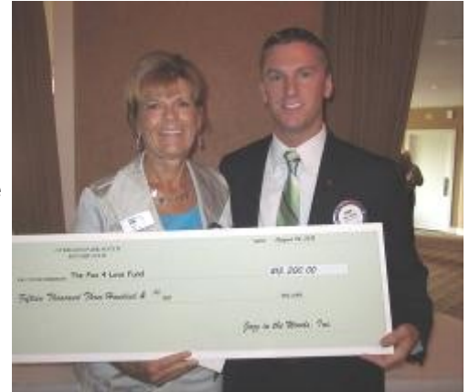
Fox 4 Love Fund receiving a check for $15,300.

During 2010 a Jazz in the Woods run was added to the weekend event on Saturday morning. This year's run included 5K Route, a 10K Route and a one mile family walk. Despite the inclement weather the morning of the run, the event still attracted over 600 people to register and had its first paying partner. The Club plans to continue to grow the run with goals of exceeding 1,000 runners next year.