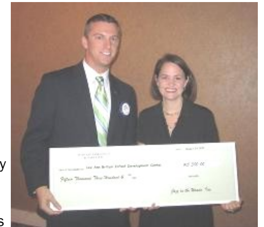
Lee Ann Britain Infant Development Center receiving a check for $15,300.