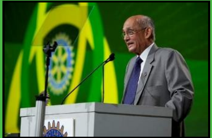
2011-12 RI President Kalyan Banerjee addresses spouses of District Governor Elects' during the Spouse Opening Plenary Session at the International Assembly, 17 January 2011, San Diego, California, USA.

Overall, in Rotary, only 11 percent of our members are under the age of 40, while 68 percent are over 50 and 39 percent are over 60. It’s not too hard to see where this will lead us in 10, 20, and 30 years down the line, if we don’t do something about it now. It is not enough to simply bring in new members. We need to bring in younger members, who will breathe new life and new vigor into our organization.