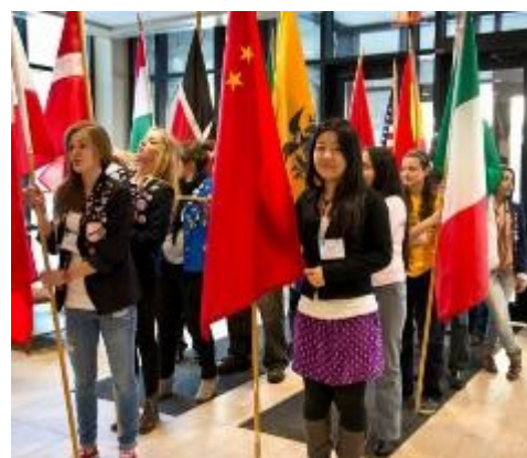
Preparing for the Parade of Flag. Front center - A K-State student representing China.

Event interviews were aired/printed by WIBW Television/Topeka, Junction City KJCK/Eagle Radio, KMAN/Manhattan Broadcasting, Manhattan KHCK Angel 95 Radio and the Manhattan Mercury Newspaper. Major donors included Briggs Auto Group, the William Richter Trust, GTM Sportswear, Bowman Bowman Novick Inc, Little Apple Toyota/Honda. Numerous Rotarians and friends of Rotary also provided generous support for the event.