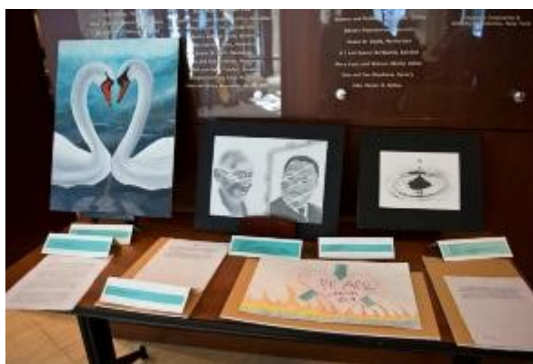
Display of some of the Youth Art Projects.

COMMENT FROM FORUM: An awesome, inspiring day!”