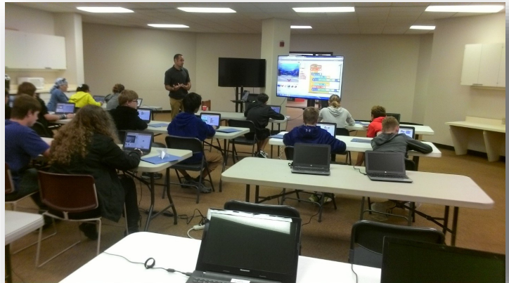
Immersive Ed conducts a gaming software class.