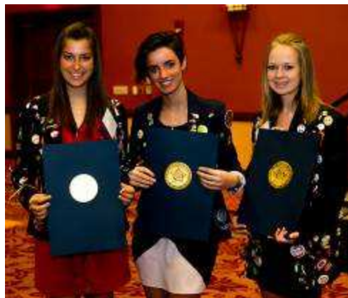
Inbound Youth Exchange Students.