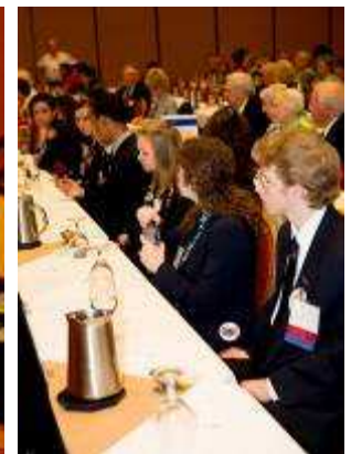
Outbound YE Students