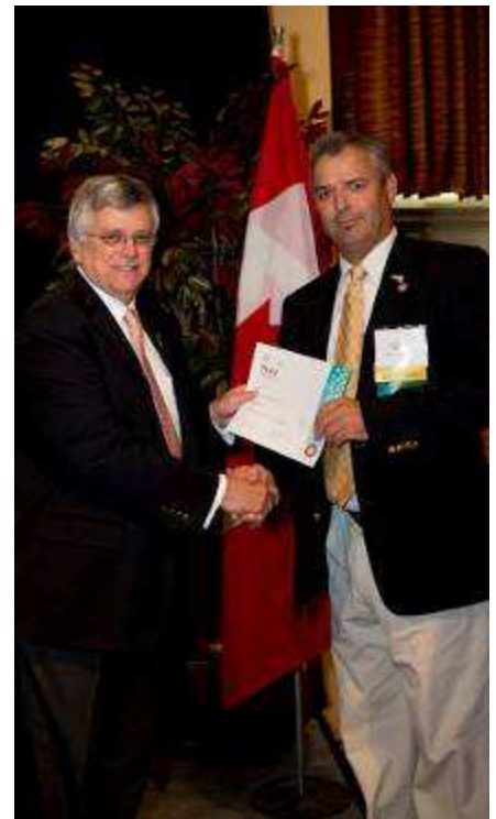
Conference photos by CE Jones