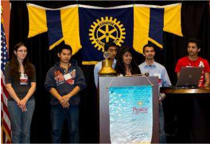
East Central University Rotaract attends District conference.