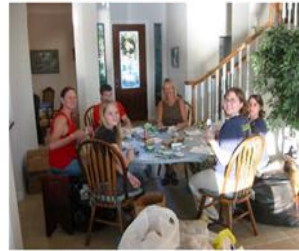
Interact Candy Rolls for Mexico

"Imagine all the people living life in Peace. You may say I'm a dreamer, but I'm not the only one. I hope someday you'll join us, and the world will live as one" John Lennon