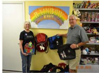
Rainbow Room – Back Packs & Bags