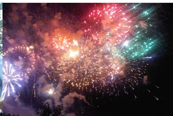
Fireworks grace the night sky at the Amelia Earhart Festival Atchison, Kansas.