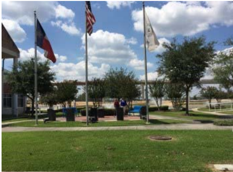
District Governor's visit to East Montgomery County included an outing to the Veterans Memorial Park.