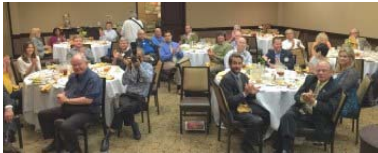
Governor was able to see Galveston Island Rotary Field.