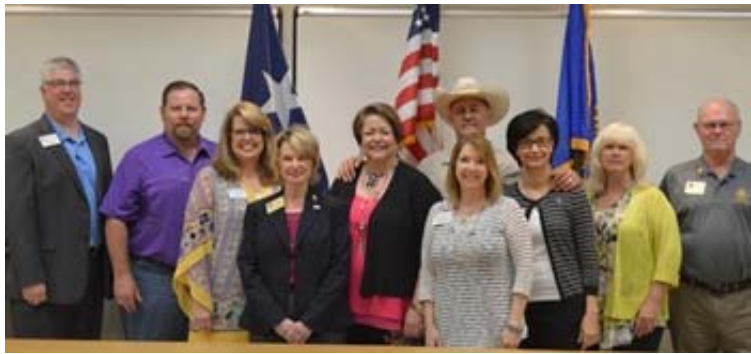
District Governor at the Hardin Rotary Club Meeting