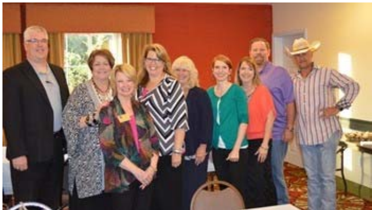
District Governor Meet and Greet with Hardin County leaders