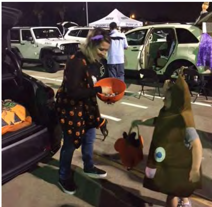
Many children participated and had a great time.

The Rotary Club of Dickinson participated with local churches and organizations in the community-wide Trunk or Treat on Halloween night. It was held in the parking lot at Dickinson High School, and it was a fun and safe alternative for families.