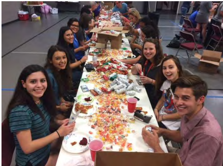
Each year Montgomery High School Interact wrap and stuff toilet paper roles with candy for the orphanages in Mexico. Montgomery