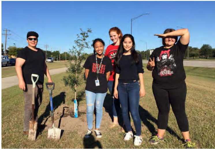
A & M Consolidated High School Interact planted trees in front of their school as they work towards their Presidential Citation.