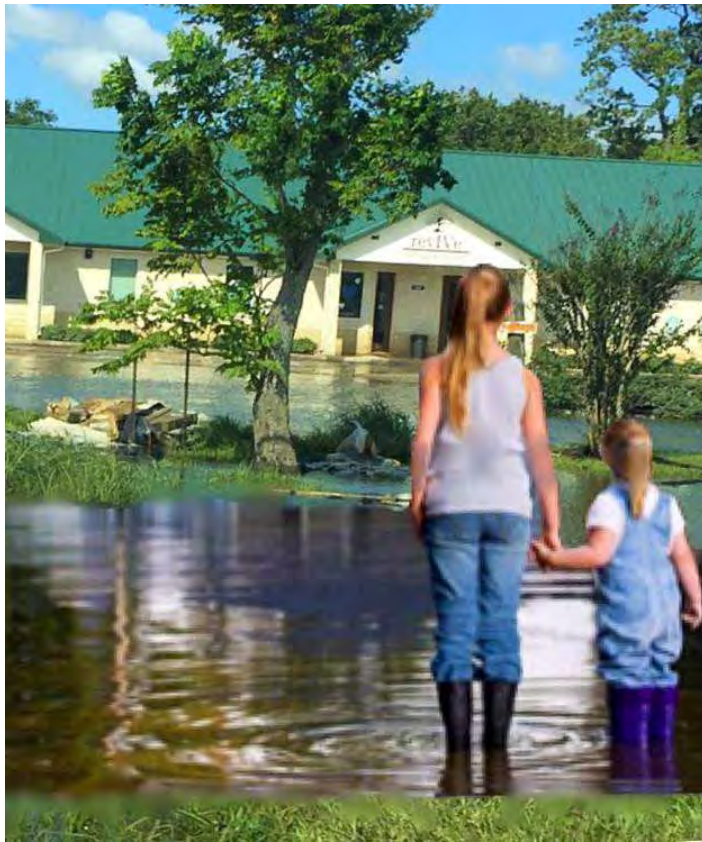
"Thank you to the Friendswood Rotary Club for helping bring my business back from the flood." – Revive Med Spa & Wellness