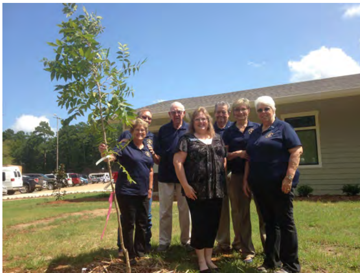
The San Augustine Club members enjoy making a donation and planting 2 pecan trees at the San Augustine Family Service Center.