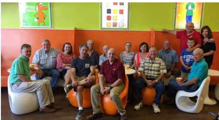
July 31 – In the spirit of fellowship, Lufkin Rotary Club gathered for an after work social over Orange Leaf frozen yogurt. Pictured members of the Lufkin Rotary Club.

August was a busy month for the members of Lufkin Rotary Club. We hosted great speakers, many guests and engaged in several community service projects. We were happy to make a difference in several ways, demonstrating our commitment to service above self.