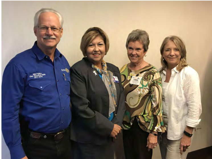
The Rotary District Governors in affected areas after Harvey convened at disaster meeting at Dallas DFW airport on 09-16-17.