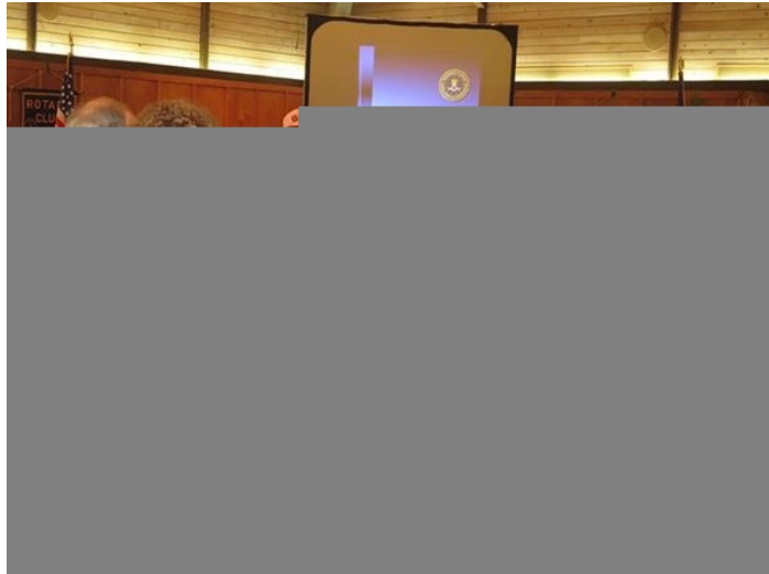
Rotarian Pat Bumpus welcoming a special guest from First United Methodist.