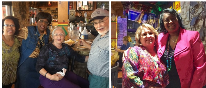
We held a Club Social at Posadas and had a wonderful time of fellowship together.