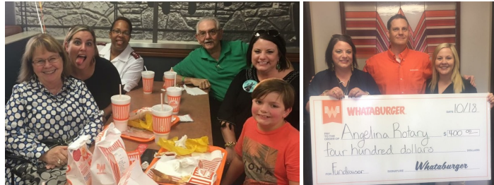
We held a club fundraiser at Whataburger and raised $400.