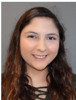
Irma College Station France