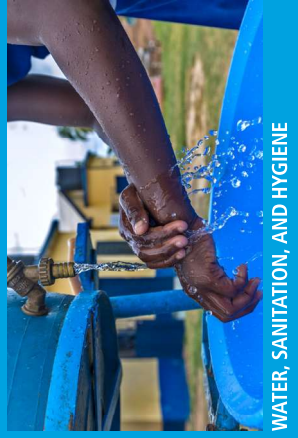
WATER, SANITATION, AND HYGIENE