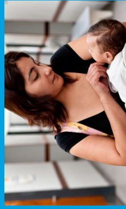
MATERNAL AND CHILD HEALTH