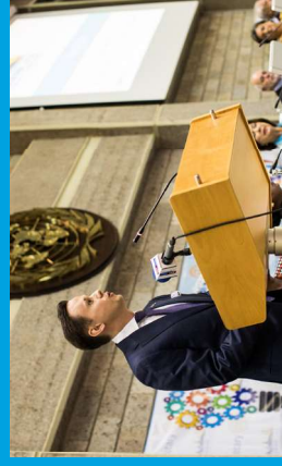
PEACEBUILDING AND CONFLICT PREVENTION