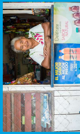
COMMUNITY ECONOMIC DEVELOPMENT