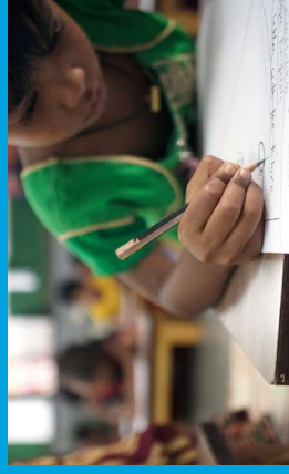
BASIC EDUCATION AND LITERACY