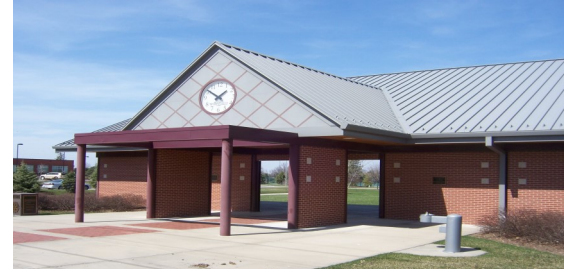
Ankeny band shell was also a Rotary project.

The Rotary Club of Ankeny took the lead in a joint venture with the City of Ankeny, the Ankeny Area Chamber of Commerce and the Ankeny Uptown Association in the fundraising and construction of the Ankeny Market Pavilion. Construction on this $2.4 million addition to Ankeny began in 2015 and was completed in 2017.