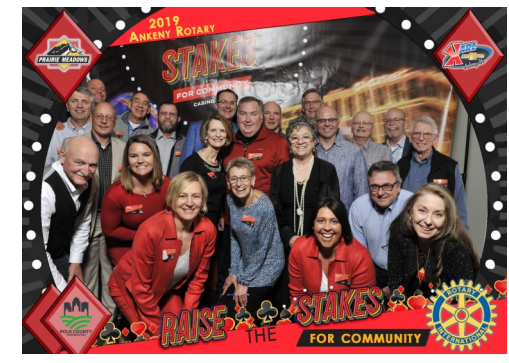
Annual fundraiser supports the community.

Some projects of Ankeny Rotarians include: Summerfest parade lineup and golf ball drop, Clean Up Days, Ankeny Service Center, Operation Warm Coats, Dollars for Scholars, Ankeny Market Pavilion, Maintenance of plantings around the Ankeny Band Shell, Reading with 1st grade students, and several international projects.