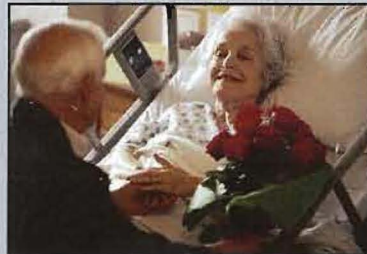
St. Anthony Hospice