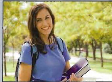
Scholarships to Kuemper and Carroll High