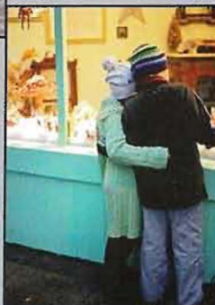
Christmas Shopping Sprees for Less Fortunate