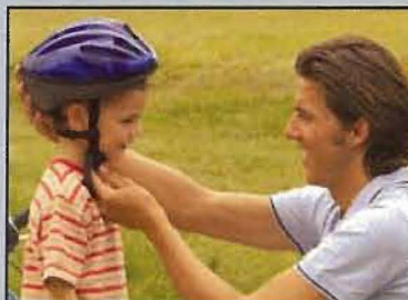
Bike Helmets for All Third Graders