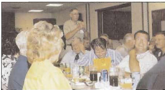
From weekly club meetings to special projects such as the Habitat House built by the Knoxville Rotary Club, service opportunities abound.