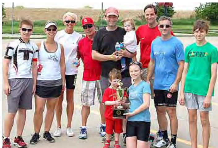
The winning team, for the most members.