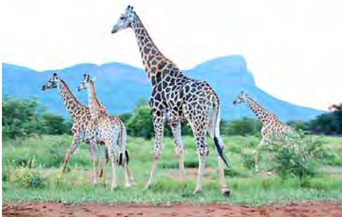
On safari at Entebeni.