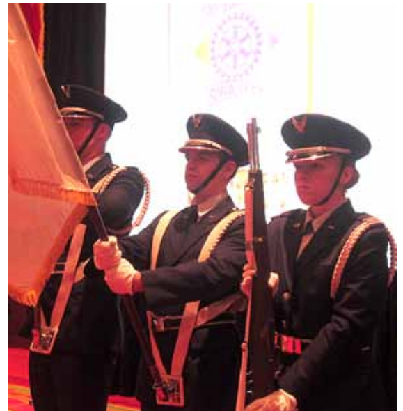
The colors were presented by the University of Iowa Air Force ROTC to kick off the Conference on Friday morning.