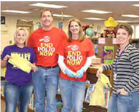
At the library ...