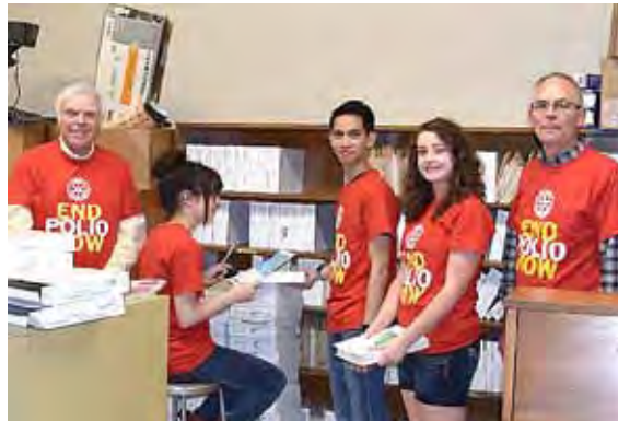
At the school ...