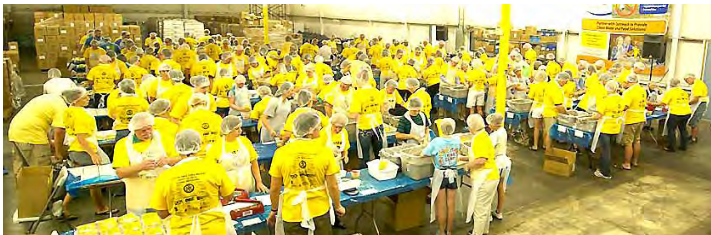
Rotarians from eight clubs packaged meals in 2014, and nine clubs will participate on July 15, 2015.