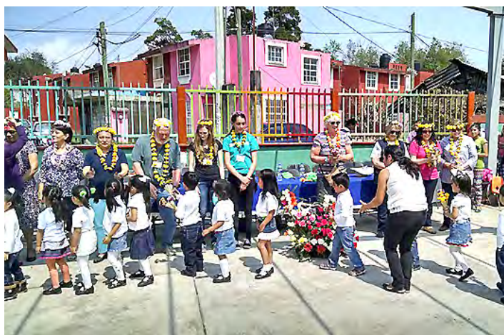
End-of-the-week celebration at the Sor Juana Inés de la Cruz Preschool.