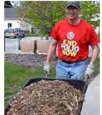
At City Hall ...