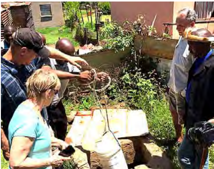
Getting water from a contaminated well.