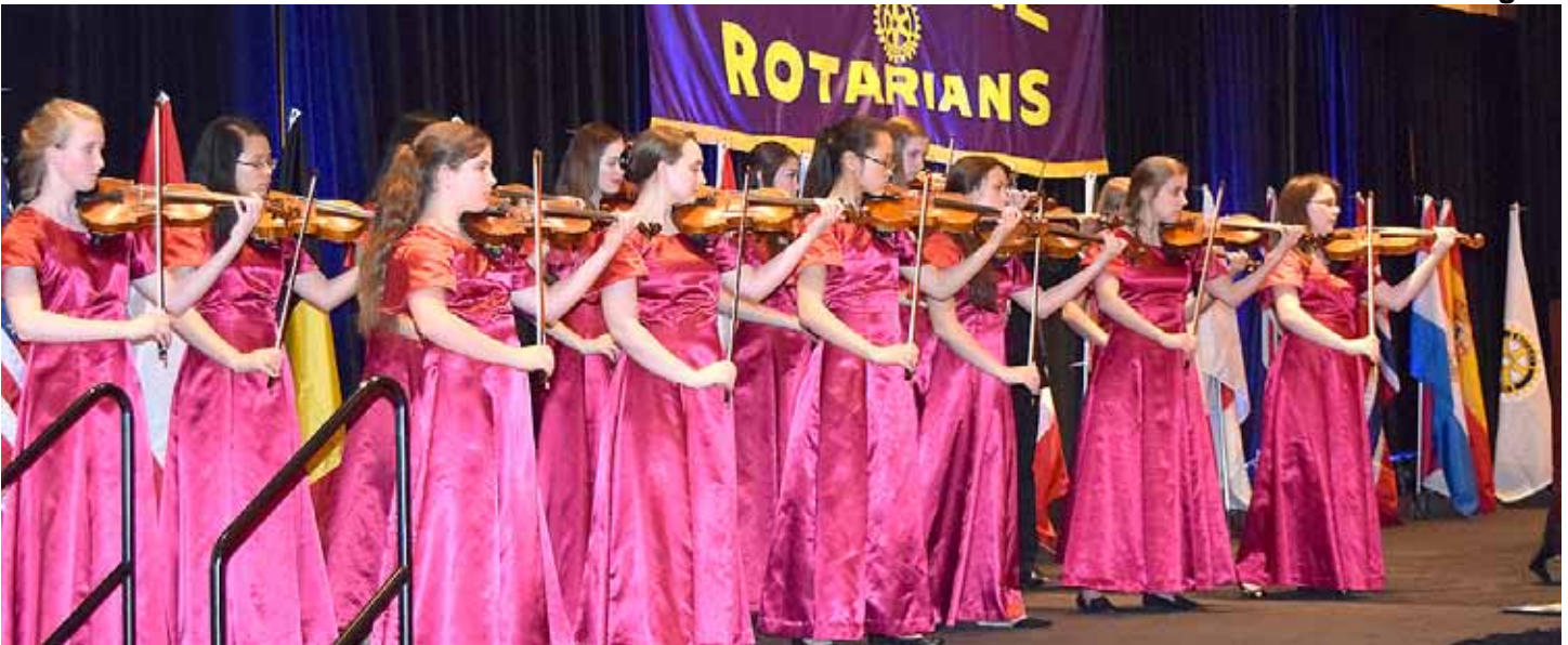
The Expresso Strings of the Preucil School of Music of Iowa City entertained at Saturday's closing festivities