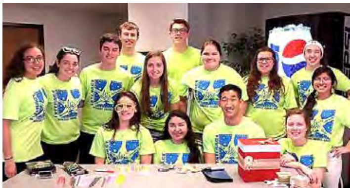
West Liberty Interactors raised $2,000 for a student who has cancer.