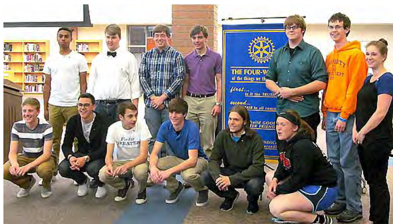
Charter night for the Interact Club of Urbandale High School.

According to Interact's charter, clubs must complete at least two community service projects each year, one of which furthers international understanding and goodwill. Through these efforts, Interactors develop a network of friendships with local and overseas clubs and learn the importance of: Developing leadership skills and personal integrity; demonstrating helpfulness and respect for others; understanding the value of individual responsibility and hard work; and advancing international understanding and goodwill.