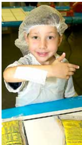
Packaging meals was fun for all ages!

Last year's meal packaging with the Iowa-based nonprofit, Outreach, Inc., was the first time eight of the Des Moines area Rotary clubs had collaborated on a project. Over 260 volunteers gathered at Outreach's Des Moines warehouse/office to package 72,576 Outreach, Inc., Mac & Cheese Meals which were delivered to various organizations serving the hungry in Central Iowa. Of the 336 boxes packaged, 169 went to the Central Iowa Food Bank. 110 went to DMARC (Des Moines Area Religious Council) and 19 boxes went to each of the Rotary clubs in Waukee, Indianola and Altoona. $18,000 was raised to help pay for the meals which are 25 cents a meal.