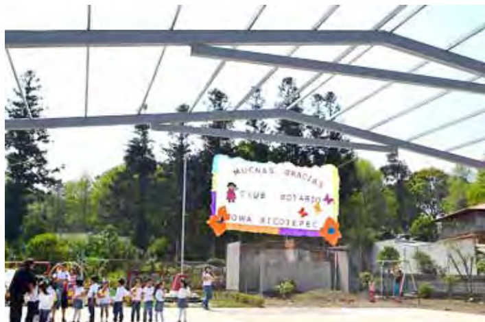
At the Sor Juana Inés de la Cruz Preschool, the framework is up for the new roof over the play area.