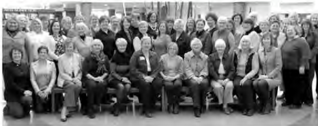
Forty-five women Rotarians gather on March 24, 2015, at the Coralville Public Library.

IOWA CITY NOON ROTARY, IOWA CITY AM ROTARY, IOWA CITY DOWNTOWN ROTARY, CORALVILLE NORTH CORRIDOR ROTARY, ROTARY DISTRICT 6000