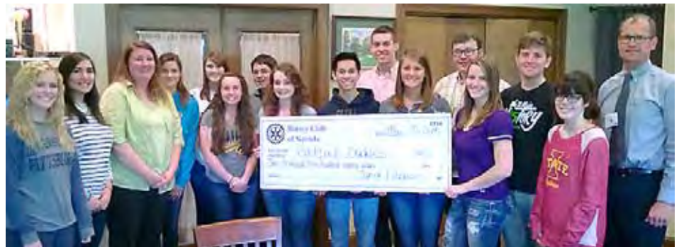
Nevada Junior Rotarians raised $2,380 to give to the Nevada Backpack Buddies. This group helps feed the free- and reduced-price lunch kids over the weekends. These kids can pick up a backpack of food and take it home for their families.