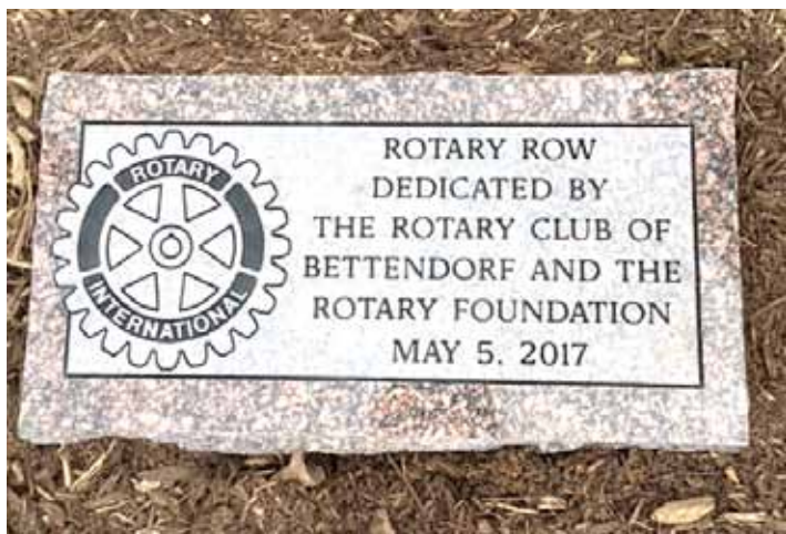
The granite plaque commemorates the sponsorship of the chimes by the Rotary Club of Bettendorf and The Rotary Foundation.