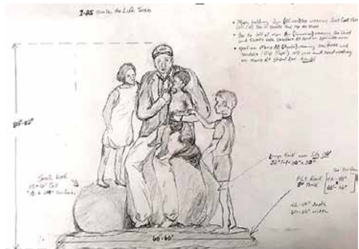
Sculptor David Biehl's sketches for the polio statue, which is projected to be 82 inches tall on a base that is 66 inches wide.