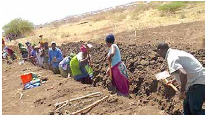
Digging trenches for water lines.

In December 2016, the members of Rotary Club of Same, Tanzania, provided Kigogo Sub-Village four days of training in effective water use. Sixty-seven men, women and school children of Kigogo Sub-Village completed the workshop. Men and women were equally represented. The topics were kitchen gardening, organic gardening, compost making, use of grain amaranth, water acts and policies, simple techniques in tree nursery establishment, tree planting and