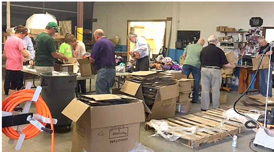
More than 25 Iowa Quad Cities Rotarian volunteers helped unbox and organize bicycle helmets for children.