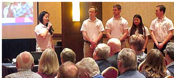
An attentive audience heard service learning students tell their inspirational stories about their activities in Xicotepec, Mexico.