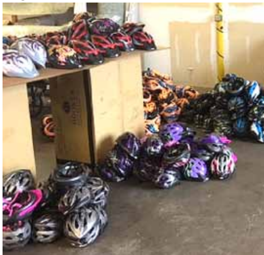
Some of the 400 bicycle helmets given away in the "Lids for Kids" program.