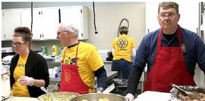
$4,000 in scholarships were awarded at the Corning Rotary Scholarship Barbecue.