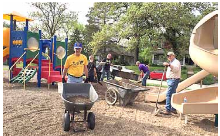
Corning Rotarians spread pea gravel around play equipment at Grove Park.

Our latest project was partnering with the City of Corning to purchase pea gravel for Grove Park. The city was able to haul a truck load of pea gravel to the park. Rotarians put in hard work to spread the gravel amongst all the play equipment at the park. We had a total of eight Rotarians and a couple youth help with the chore of spreading a truck load of pea gravel.