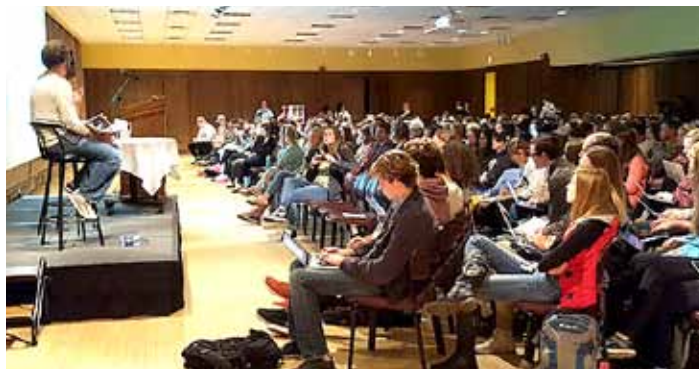
Large audiences attended forums on human trafficking.

• Rotary funded the production and display of anti-trafficking signs for the CyRide buses in Ames. Primarily high school and college students ride CyRide. The signs were designed by Iowa State University students. Houck Transit Advertising produced the signs and displayed the signs on buses. All the CyRide buses rotate to a new route daily, giving full market coverage. The signs were displayed for three months.