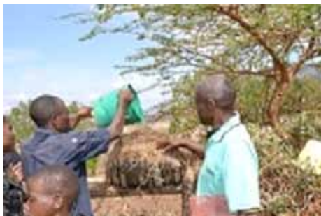
Water for life in Tanzanian villages