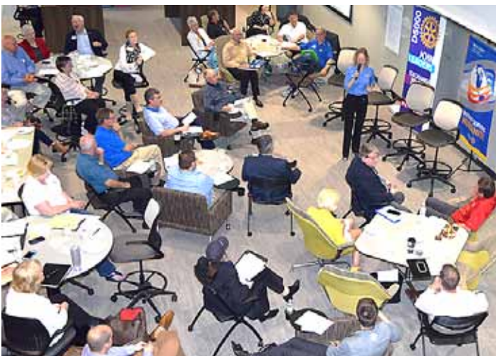
The Membership and Visioning meeting at Shive-Hattery in West Des Moines was well attended.

Next year at least one Vision 2020 District Membership Event is being planned. A Vision 2020 Membership Event will be held May 2, 2018, at the Shive Hattery Office in West Des Moines. Other locations may be added. Check the next issue of the District Newsletter for more information.