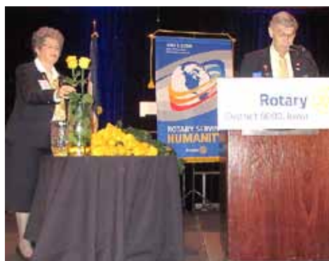
Rotarians were remembered at the necrology service at District Conference.