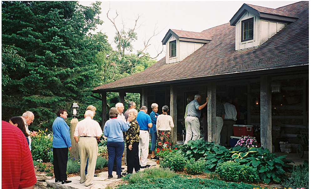
Rotarians and guests line up for an anniversary feast of sweet corn and steaks.