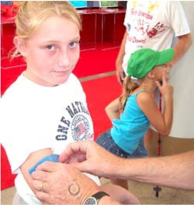
Water soluble Rotary wheel tattoos were a big hit with children at the Iowa State Fair.