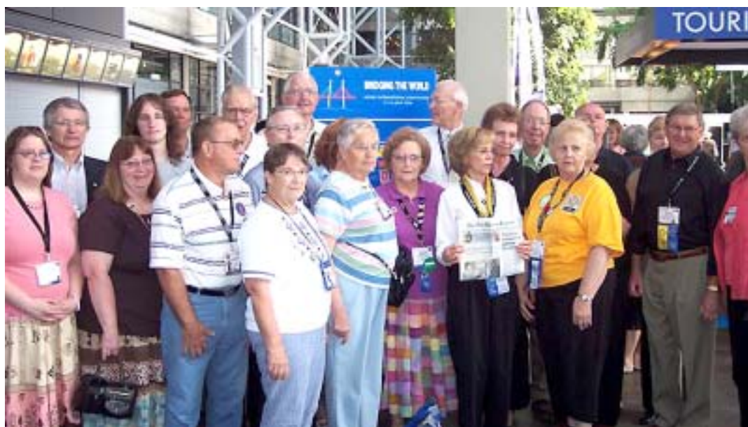
Rotarians from District 6000 were among the 15,000 at this year's convention.

Another morning, we chatted with some Rotarians, when one