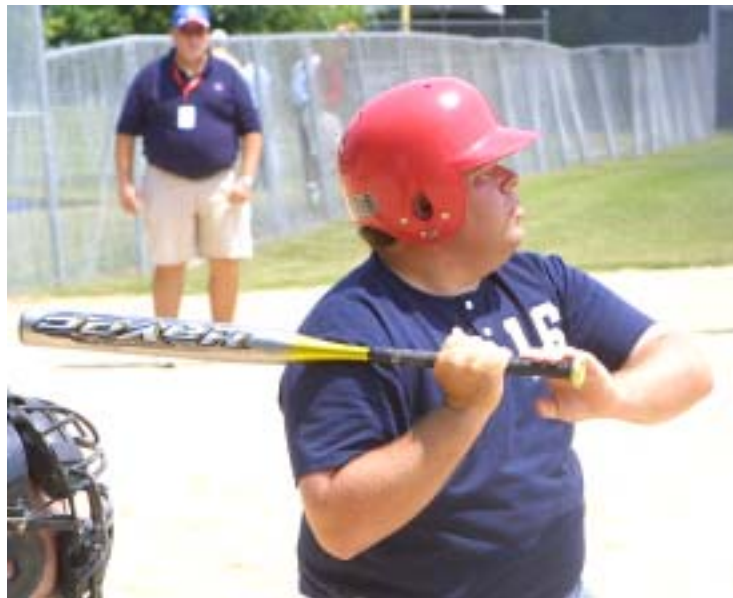
Athletes competed hard and played to win, but always adhered to the Special Olympics motto: "Let me win, but if I cannot win, let me be brave in the attempt." Competitions were held in athletics, aquatics, basketball, bocce, bowling, golf, gymnastics, power lifting, soccer, softball, tennis, volleyball and Motor Activities Training Program (MATP).