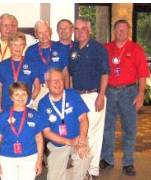
... es of Rotarians who lent their hands to make the Special Olympics a success. The festivities included a reception for the athletes at the Ames and Ames Morning, and District 6000.