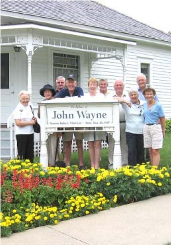
Friendship Exchange team members from New Zealand visited the John Wayne birthplace at Winterset with District 6000 Rotarians.

Group Study Exchange is a wonderful Rotary Foundation program that enables young professional Iowans to reach out to another country and culture, and enables clubs to bring a piece of the world into Iowa. For both ends of the exchange, it can be a life-changing experience!