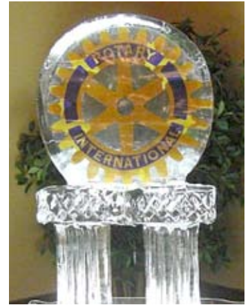
The "ice" at Saturday night's Fire and Ice Banquet.