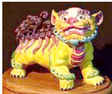
Traditional Oriental symbols were extraordinary for their craftsmanship.

The Taiwan Rotarians had many questions for us. They asked how we all felt about our new president and the trials that America was going through. Every day we got similar questions and the team was very good in giving the best answers to the various Rotarians who asked the questions. The team was doing so well that it seemed to