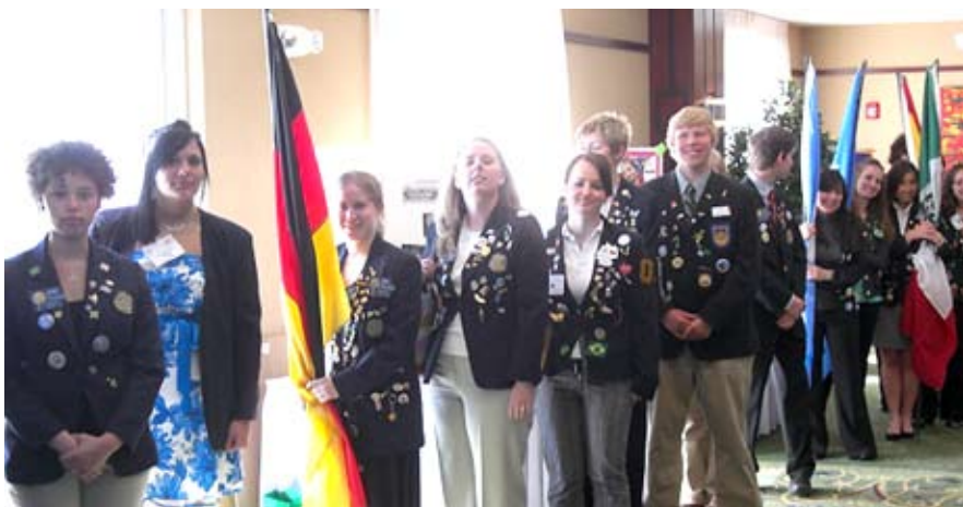
Rotary Youth Exchange students, with their flags from many nations, were one of the highlights of District Conference.