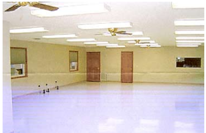
Columbus Community Senior Center rebuilt with state certified floor coverings.

total cost for the flooring was $9,790.28, which was a very close match to your timely contribution.