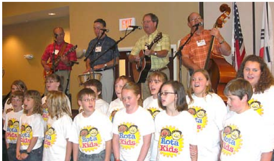
The Decatur County Rota-Kids joined the King'N Trio in rousing renditions of "The Four-Way Test Song" and "One Hundred Years of Rotary."