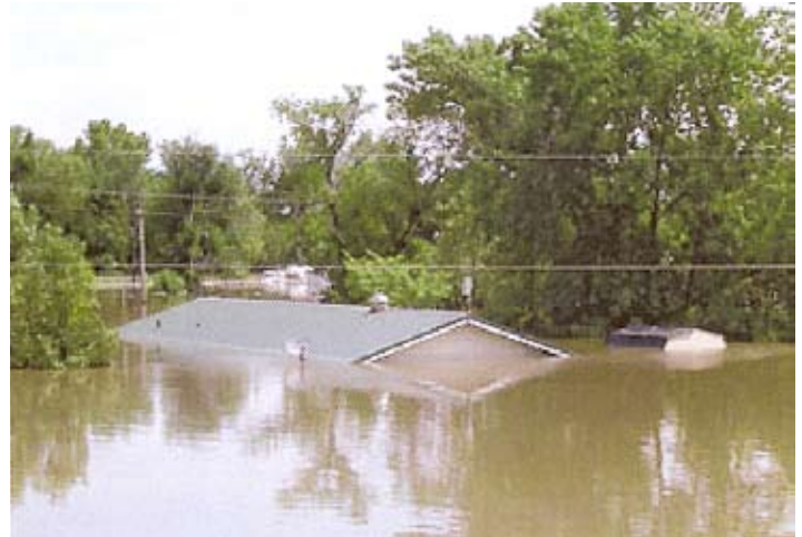
Columbus Community Senior Center during the flood.