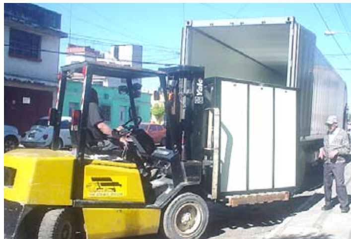
A shipment of humanitarian supplies from Iowa Rotarians arrives at Patzcuaro, Mexico in 2008.