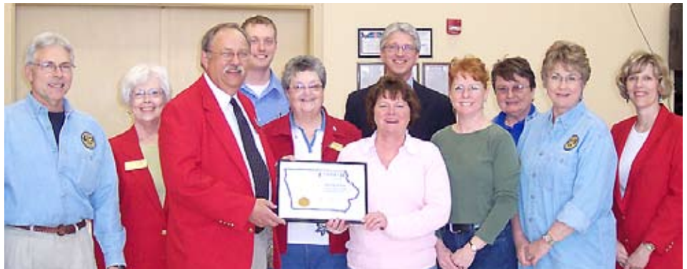
The Fairfield Area Chamber of Commerce Ambassadors welcome the Fairfield Rotary Club as new members to the Chamber before the start of their 2009 benefit auction at the Fairfield Arts & Convention Center.

The funds raised will aid the fire department's purchase of thermal imaging camera. The camera allows firefighters to identify areas of heat through smoke and