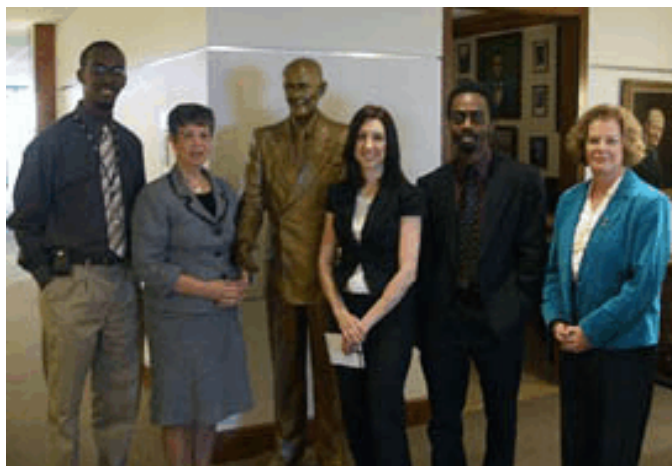
Rotary International District 6380's Support Team

T he Rotarian Video Magazine is a DVD series that showcases extraordinary Rotary projects and people from around the world. Produced three times a year, RVM DVDs feature three to four short video stories designed to motivate, educate, and inspire. Show one or more stories at club meetings, new member orientations, or on community cable network channels. Give copies of RVM to Group Study Exchange participants, club speakers, and area libraries and schools. To order go to www.rotary.org Search RVM. Order single copies of RVM for $15 or subscribe for just $30 and receive a new DVD three times a year.