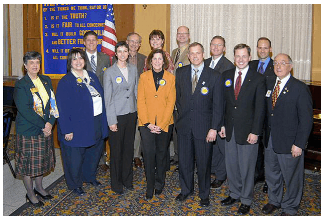
ANN ARBOR ROTARY CLUB'S MEMBERSHIP BLITZ A HUGE SUCCESS