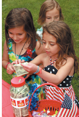
Eager EPN Donors

It's Happening! Only one Nigerian polio case is reported 2010 year to date compared to 90 last year, seven countries reported polio cases YTD compared to 14 last year. How? Huge efforts such as the recent 19 African country campaign by 400,000 volunteers and workers that immunized 86 million children and similar efforts in other world areas. If we slow down now, momentum will be lost and polio will come screaming back. We are so close.