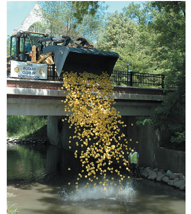
"Northbrook club launches hundreds of yellow rubber ducks for polio fund raiser."

What can we do? To pull its fair share, each club should contribute $2000 per year for the five year program. How? Get your respective communities involved. Not sure how to do that? Ideas are found on the Rotary web site. More ideas are on the District 6440 web site. Call the District EPN committee and we will help you one-on-one. We are sooooo close. Let's finish the job!