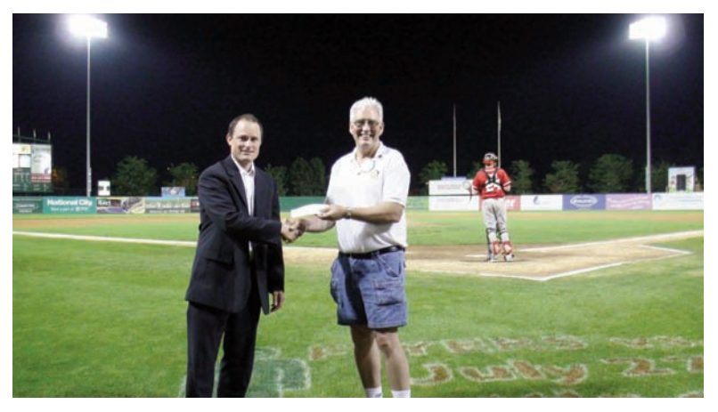
A beautiful night at Alexian Field in Schaumburg

Rotary Night with the Flyers featured a minor-league baseball game on Thursday, July 30 that evening After expenses we raised $7500 for Rotary donations. There were approximately 150 Rotarians from the area in attendance. The Dundee Club brought 40 children from the Boys and Girls Club in addition to the 800 children and young adults we sponsored from Clearbrook, Kenneth Young and Campenelli YMCA. One of each of these young people threw out the first pitch. It was an exciting evening for the participants and a rewarding evening four our club.