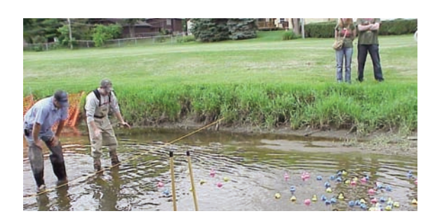
Duck Race. . . . . . and the winner is. . . .

The $2,000 Rotary grant money will be used to purchase trees, bushes, and native plants for planting along the creek. Public Works and the Park District personnel will first clear vegetation and regrade the project