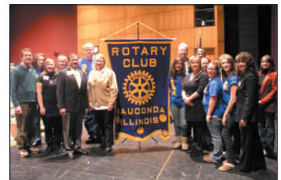
New Internet Club - Wauconda High School Sponsored by the Rotary Club of Wauconda