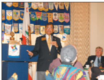
Governor Bill accepted an invitation to speak at the Rotary Club of Los Angeles, Westwood Village, CA.