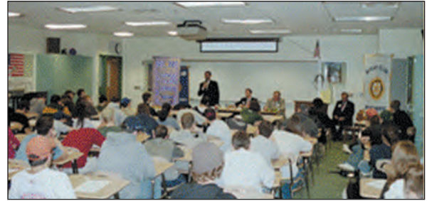
Program started at Glenbrook North High School in 2002 - 8 straight years - 2 days - 8 Classes - 400 students - over 4,000 students since inception

The business principles and ethical standards outlined in the Four Way Test are more important than ever in the current economic climate. VOCATIONAL SERVICE IS MORE IMPORTANT THAN EVER. High School students are depressed because of unethical business persons so Let District 6440 Rotarians step up and address this situation. (We have some programs that work).