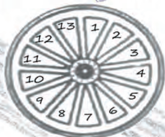
1905 ROTARY LOGO - 13 SPOKES

THE ORIGINAL ROTARY LOGO IS UNUSUAL BECAUSE IT HAS 13 SPOKES. A REAL WAGON WHEEL TYPICALLY HAS AN EVEN NUMBER OF SPOKES. THE INTENT OR SIGNIFICANCE, IF ANY, OF THE ODD NUMBER OF SPOKES IS NOT KNOWN.