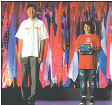
Local youngster honored at International Convention