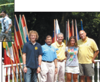
Gov. Bill welcoming Youth Exchange Students to the Y.E. party.