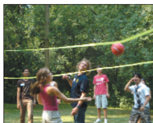
Youth Exchange Students enjoying a game of Volleyball

Today's youth are Rotary's future. The Future of Rotary Is In Your Hands.