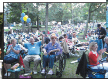
Rotarians enjoying the fellowship at the Rotary evening at Ravinia.