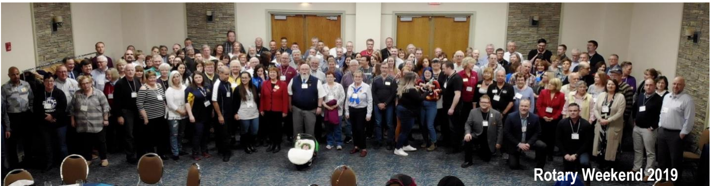
Rotary Weekend 2019