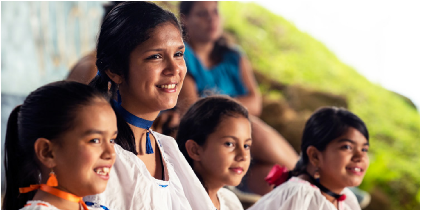
A Rotary global grant, working in partnership with CATIE, provides support for training in business skills and aquaponic gardening and the development of an ecolodge for tour groups and training in Costa Rica.

Rotary's Promise Club is a club with 100% of members supporting the Endowment at $1,000 or greater, by outright gifts or a commitment.