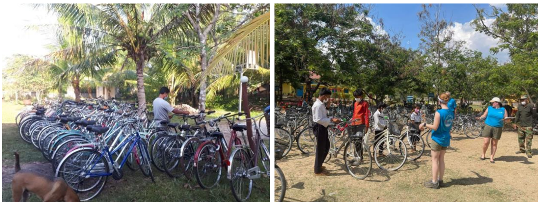
(Arrival of the bicycles, left, and organizing the assembly process, right)