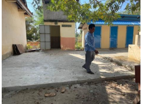
(Renovation of latrine block, left, new well, center, and new concrete pad, right)