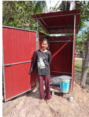
(Some of the very happy villagers posing in front of their new latrine)