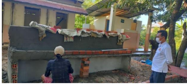
(Renovation of one latrine block, left, and building of the 16-faucet wash area, right)