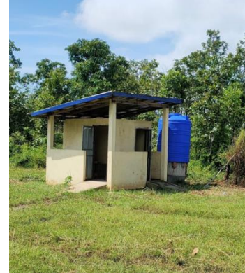
(New well head, left, schools desks arriving, center, and renovated latrine, right)