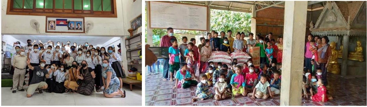
(Peoples Improvement Organization, left, and Hopeful Association of the Poor, right, posing with their food donations)