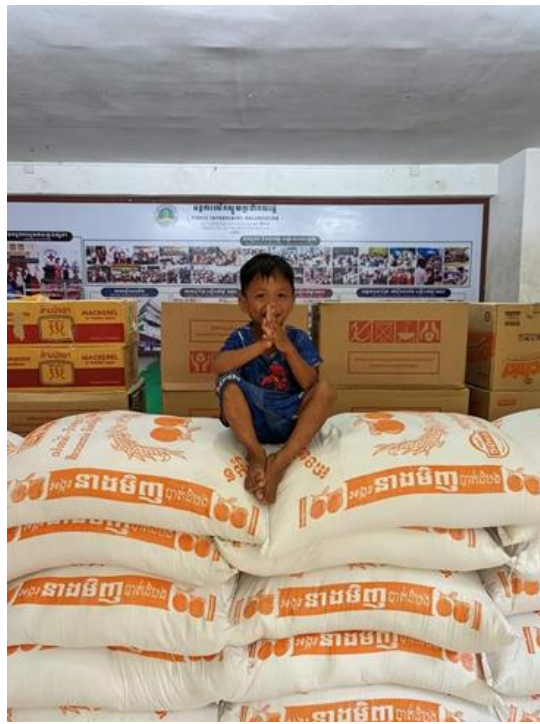
(A warm thank you from one of the happy children at PIO)