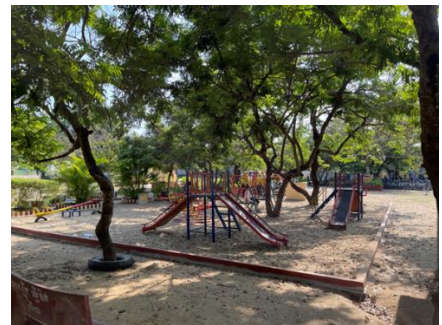
(Wash area, left, well and storage tank, center, and renovated playground, right)