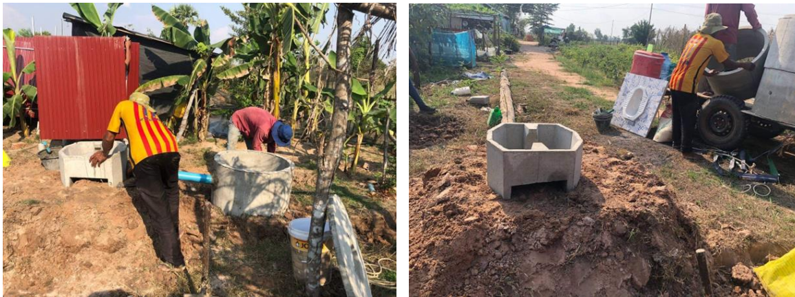
(Assembly of a latrine at Ta Hok Village in Sotre District. On-site assembly typically takes five hours per latrine).

(UNICEF, Country Programme 2019–2023, CountryProgramme Water, Sanitation & Hygiene.pdf .pdf (unicef.org) )