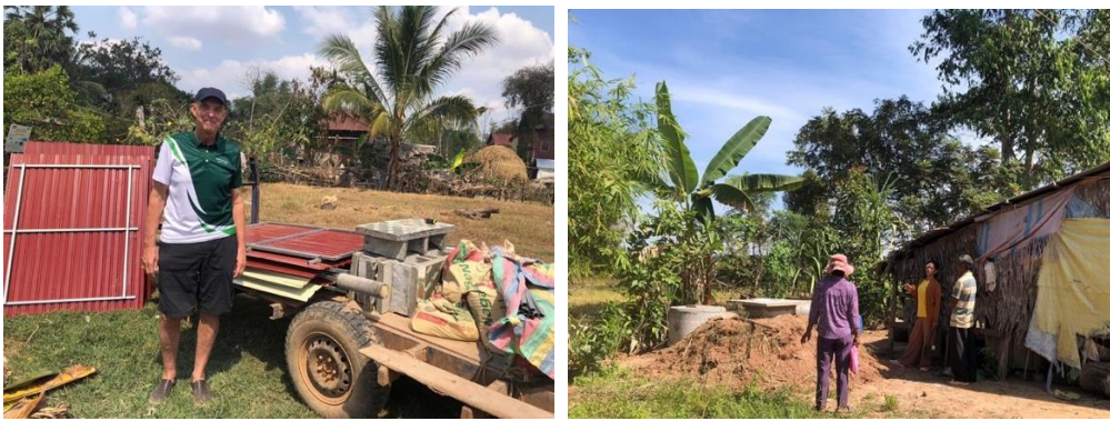
(Assembly of a latrine at Ta Hok Village in Sotre District. On-site assembly typically takes five hours per latrine).

(UNICEF, Country Program 2019–2023, CountryProgramme Water, Sanitation & Hygiene.pdf .pdf (unicef.org) )