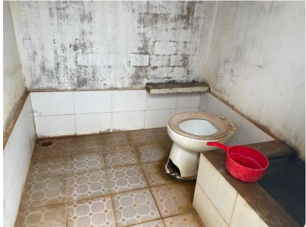
(Latrines prior to the renovation)