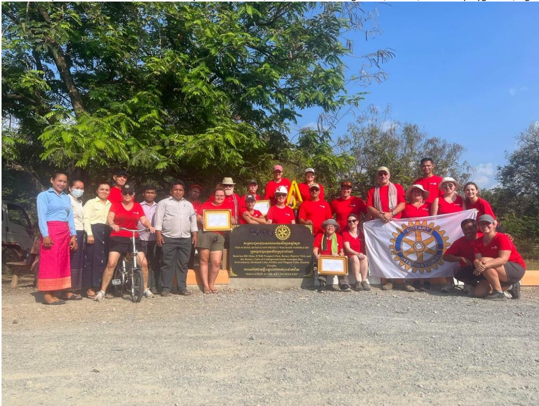
(The team with teachers, posing at the Rotary plaque which recognizes the donors who made this school renovation possible)