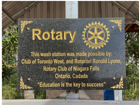
(The multi-tap wash area will now serve the entire school, helping to eliminate the spread of germs)