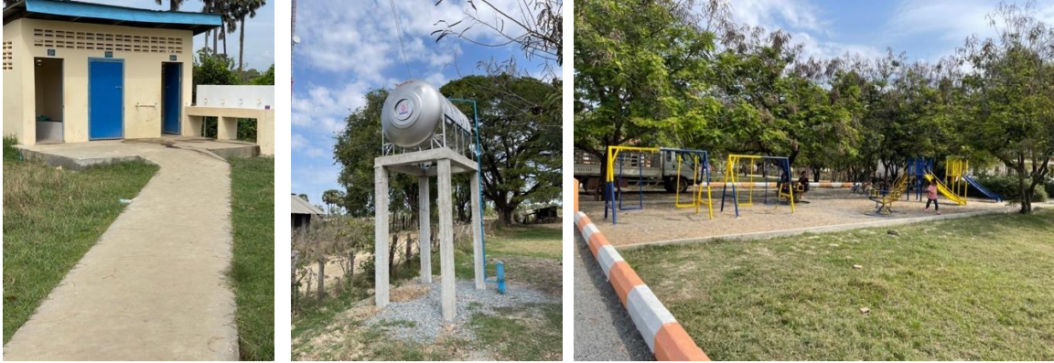
(Renovated latrine, new walkway and wash area, left, well and storage tank, center, and new playground, right)