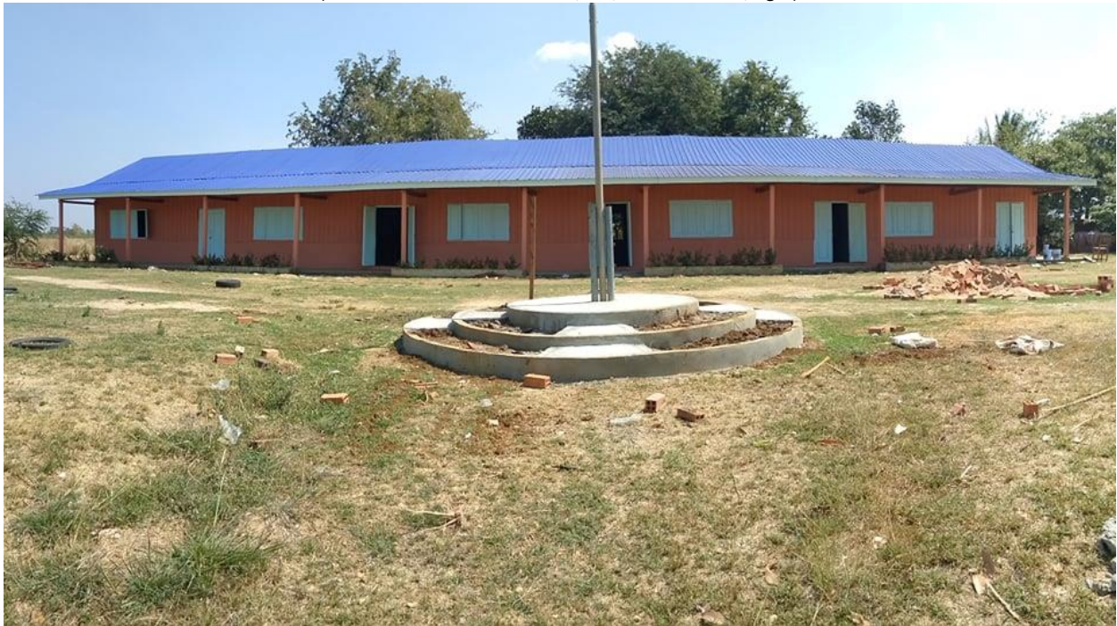
(The renovated school)