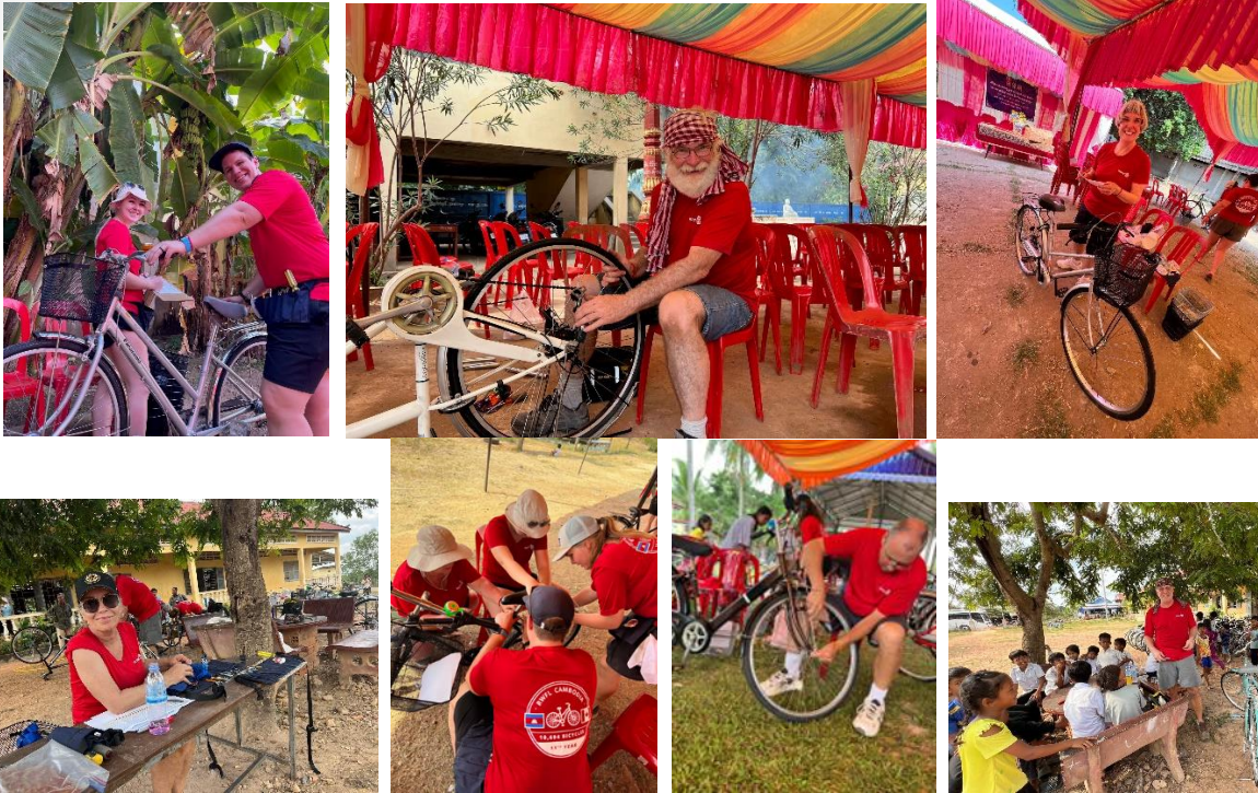
(RWFL Team 2023 building and repairing the bicycles in advance of the distribution process)