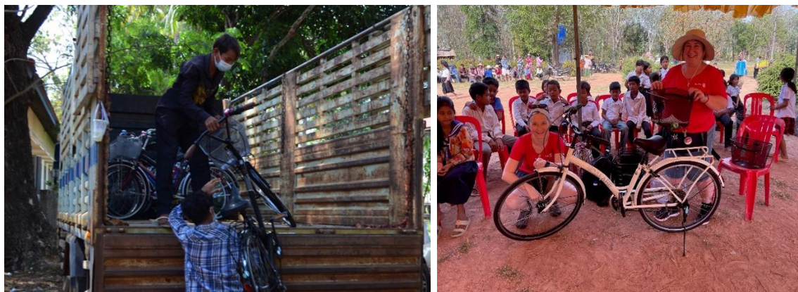
(Arrival of the bicycles, left, and bicycle assembly, right)