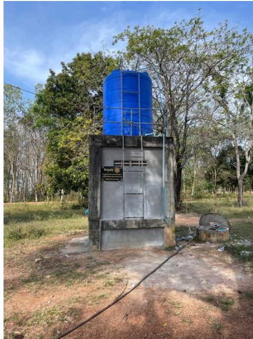
(The water filtration system, left, testing the water, right, and the final product above)