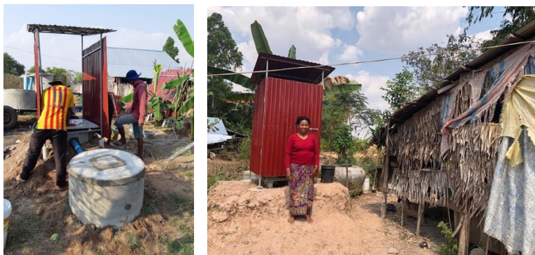
(Finishing up the installation, left, and inspecting the finished product, right)