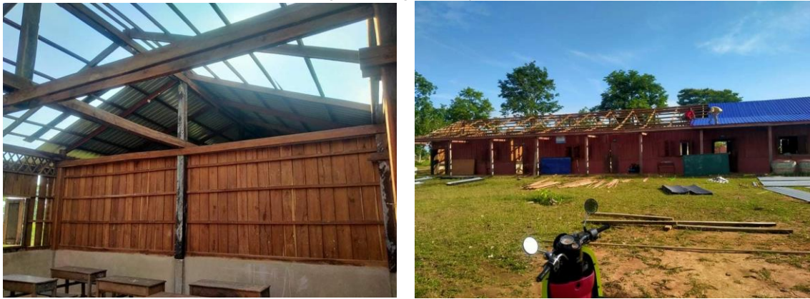
(Installation of new side boards, left, and metal roof, right)