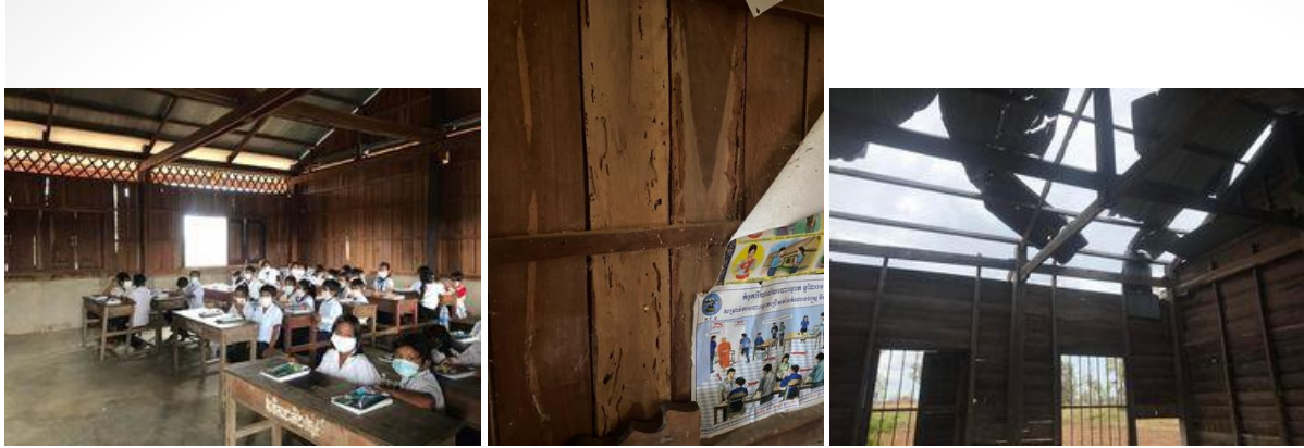
(Pre-renovation showing the damage done by the termites and weather)