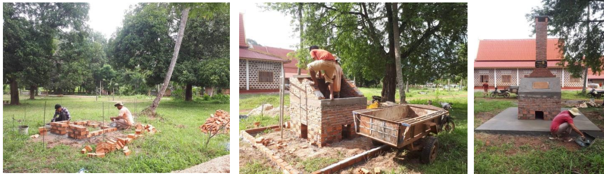
(Building the incinerator, left, center and right, the finished product)

With the incinerator, the garbage burns completely, and the tall chimney enables the smoke to drift away from the children at the school.