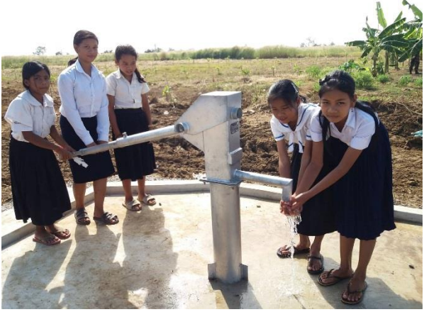
(Local school children posing with the new well)