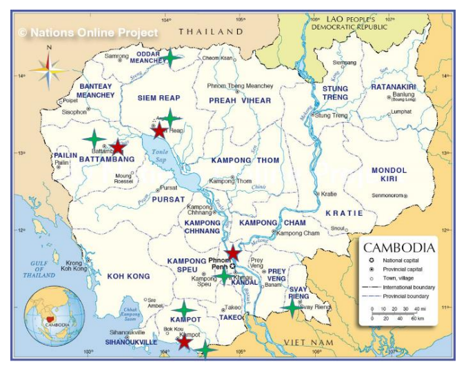
(The red stars indicate our distribution hubs - where we have a hotel, and the green stars are the actual distribution locations)

The bicycles are purchased in Phnom Penh for $37.00 US, and then transported to the actual distribution site via a local contractor. As the bicycles are gently used, we have a team of "bicycle mechanics" who conduct the repairs and verify the serviceability of the bicycle. Spare parts are purchased in Phnom Penh prior to the first distribution so that we are equipped to make all necessary repairs - typically 1 in 2 bicycles require some type of repair (tire change, tube repair, brake cable replacement, chain adjustment). Our goal is always 100 % serviceability for each bicycle so that every child receives a bicycle that is as close to new as possible.