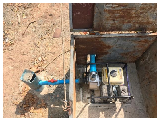
(The well and pump assembly)