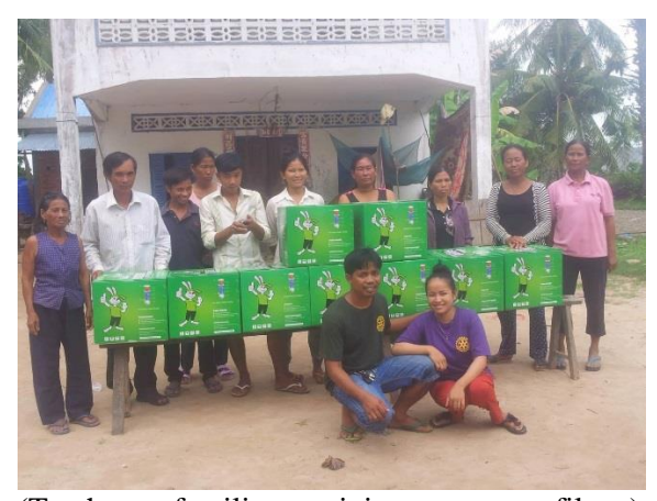
(Ten happy families receiving new water filters)

Approximately 80 percent of all Cambodians living in rural areas have limited access to safe drinking water. This holds true in all of the schools we interact with - although they may have a well, the water still needs to be filtered or treated to be made safe to drink. To begin to address this issue, we distributed two water filter systems to each of the schools we visited, and provided water filters to 15 families in two separate villages located in Kampot Province. In each of these villages, they were using ponds, which animals had access to as their drinking water. In future years, we will continue to provide the water filters to all schools we interact with.