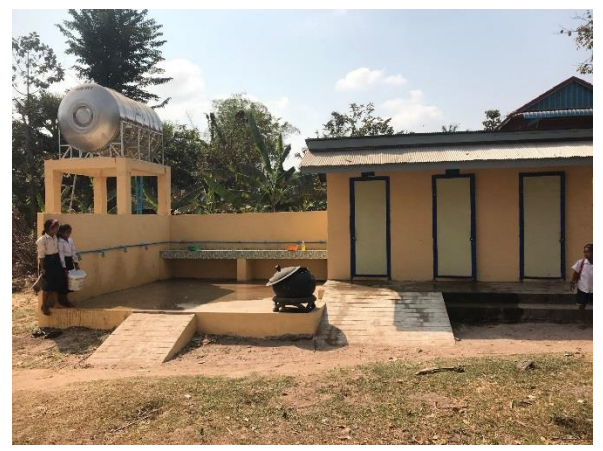
(New wash area, storage tank and latrine)

soap, and renovate the playground. These improvements have already bore fruit as attendance is way up and sickness has dropped.