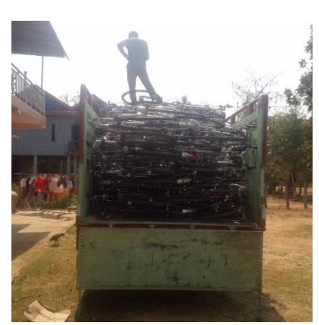
(The arrival of the bicycles)