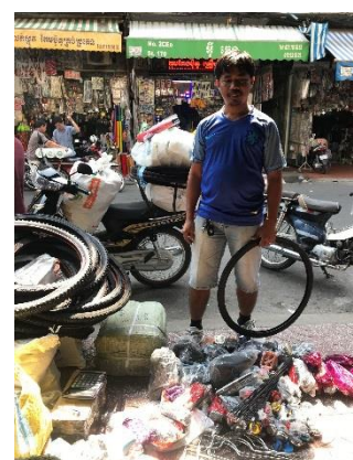
(Purchasing spare parts)

After the bicycles are assembled and ready for distribution, we conduct a formal ceremony which local government officials and district school board members attend. At this point, we give a dental hygiene demonstration for the children and then provide each child with a new toothbrush and toothpaste. Once the formalities have been completed, we distribute the bicycles to the children, who for the most part have waited patiently for many hours in the hot sun.