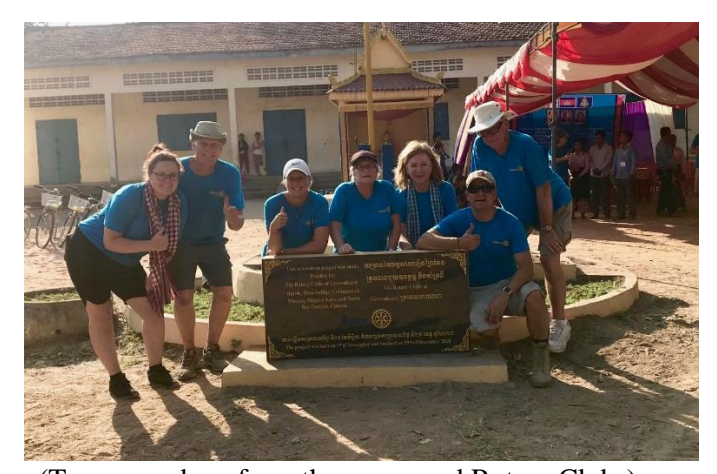
(Team members from the sponsored Rotary Clubs)