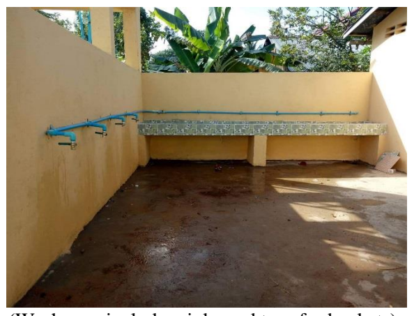
(Wash area includes sinks and taps for buckets)