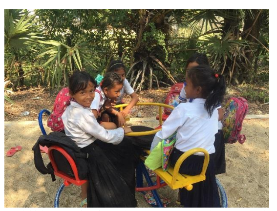
(Children enjoying the renovated playground)