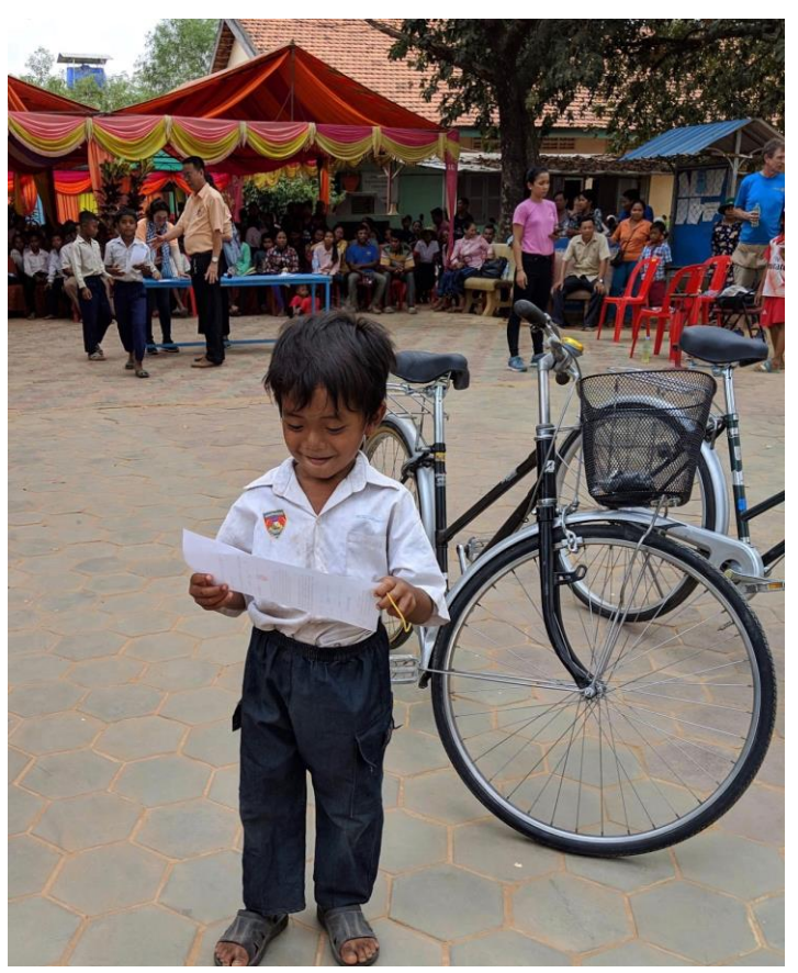
ROTARY WHEELS FOR LEARNING 2019 POST TRIP REPORT

This report covers the Rotary Wheels for Learning Team 2019 accomplishments in Cambodia, and outlines the goals for the Rotary Wheels for Learning Team 2020.