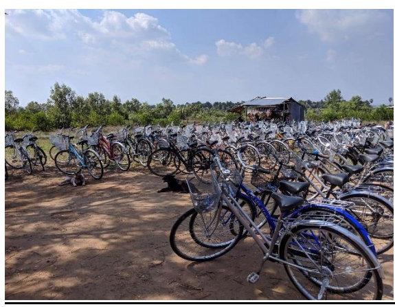
(Our guard dogs protecting the bicycles)