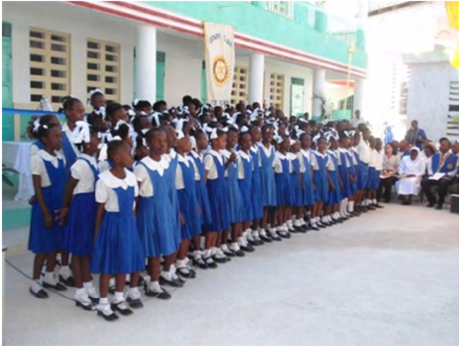
At left – Students in 6 th Grade thanking Rotary with a song.