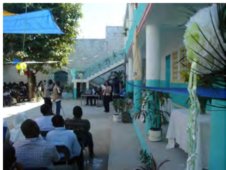
Centre – Children dancing. Right – Members of the audience.