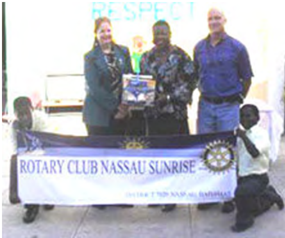
At left - The Rotary Club of Nassau Sunrise celebrates Literacy Day with a book donation to the Mabel Walker Primary School in Nassau.