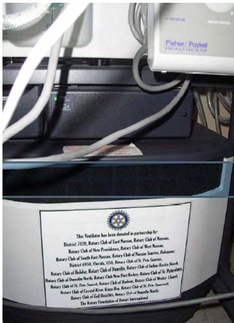
(Matching Grant #73553)

We would like to say a very heartfelt thank you to all of the Rotary Clubs and District 6950 and the Rotary Foundation of Rotary International who have contributed to this life-saving initiative."