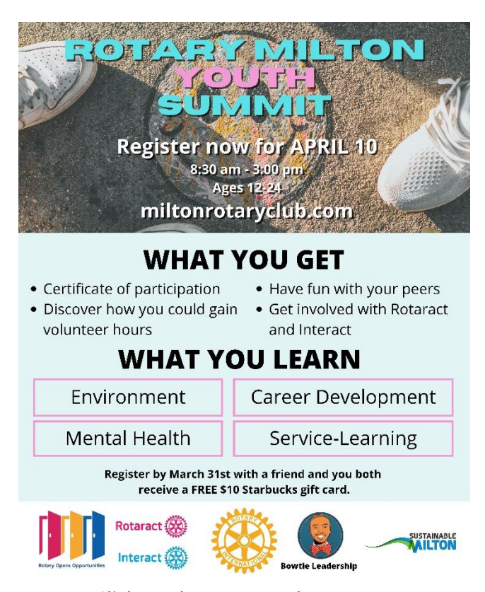
Click on the poster to learn more

Halton Interactors, Rotaractors and Rotarians are excited invite you to a virtual leadership event on April 10. The event will focus on 4 main themes Environment, Mental Health and Service Learning and Careers. These topics will be covered by entertaining keynote speakers, presenters, panels and workshops. You won't want to miss this so save the date and sign up today. Spaces are limited so tell your friends. Early registrants will be eligible for attendance gifts and prizes.