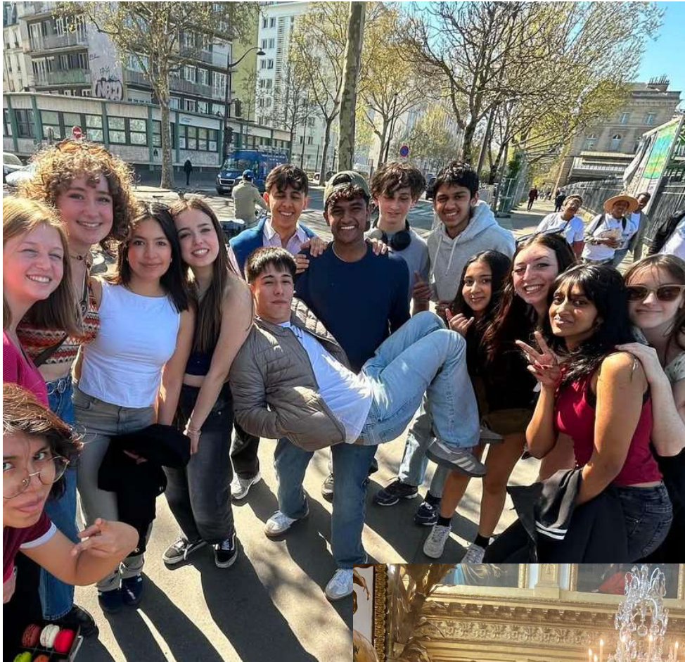
My amazing exchange group who are my second family while we were in Paris!