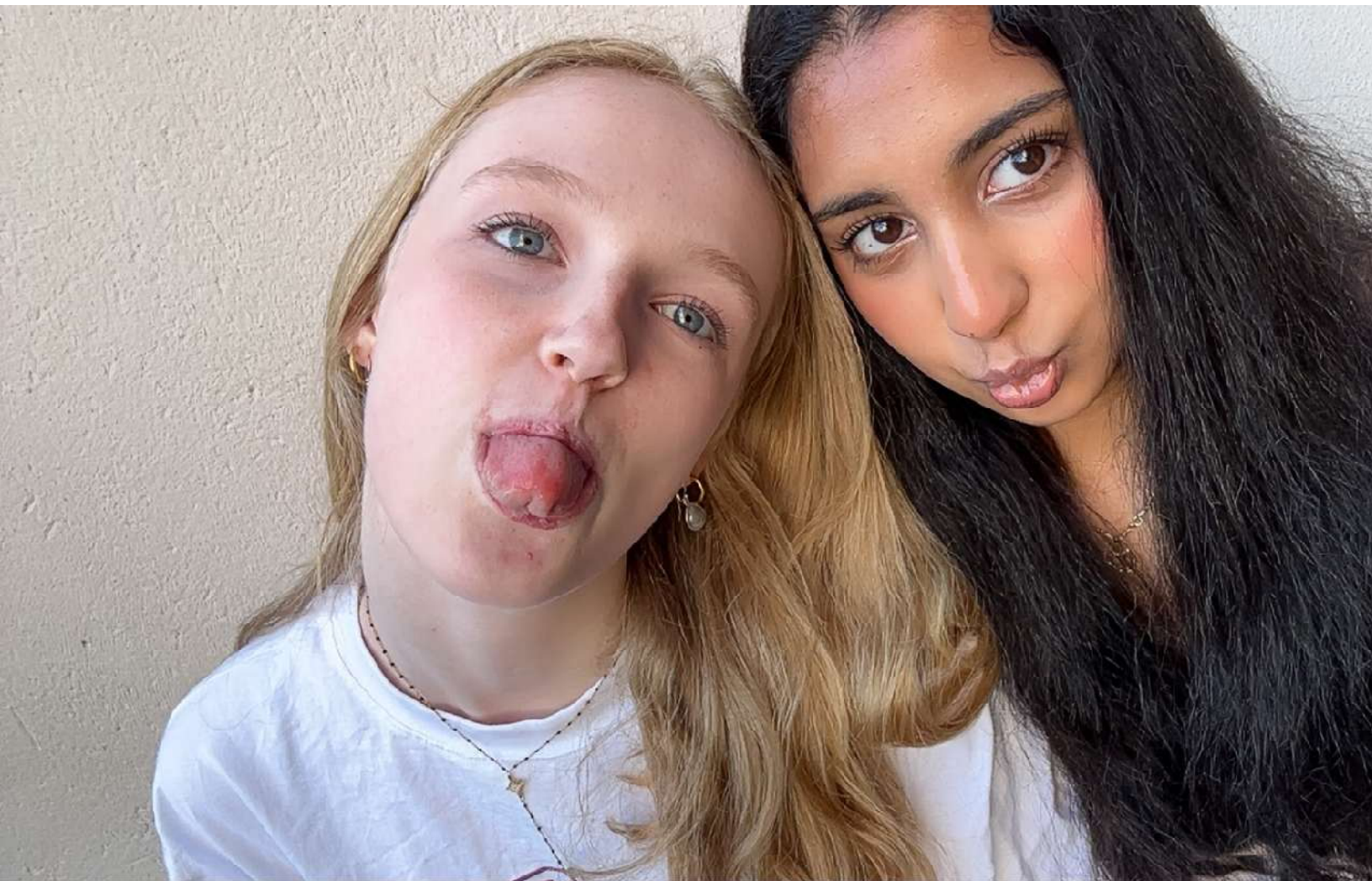
Me and my best friend from school