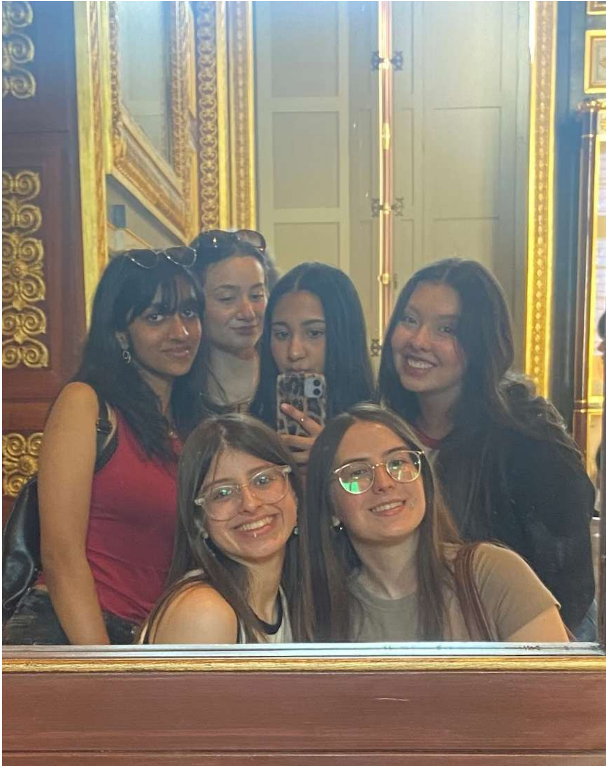
Me and the exchange girls from another district during our Eurotour in le Louvre