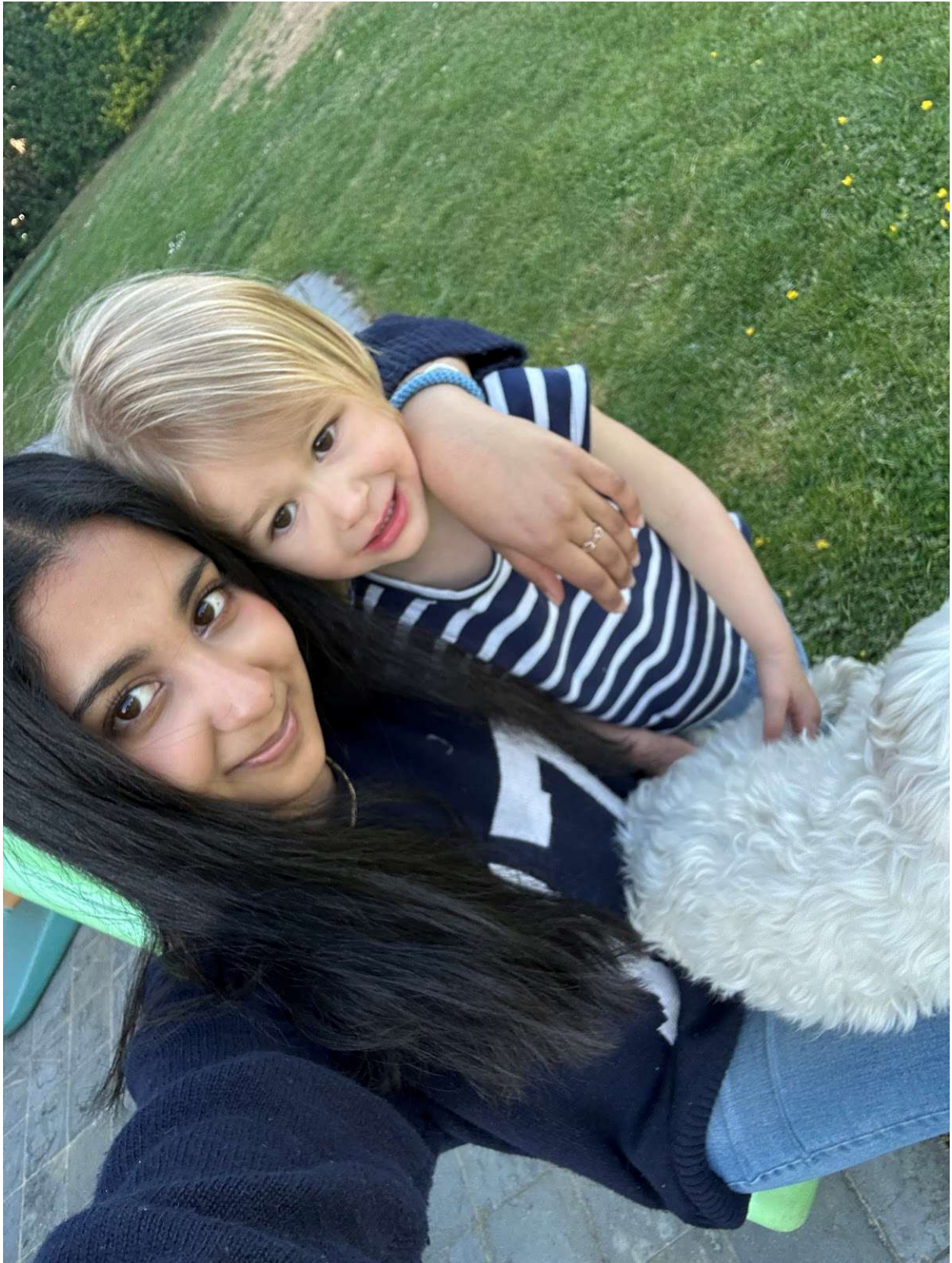
Me and my little host sister who's my best friend.