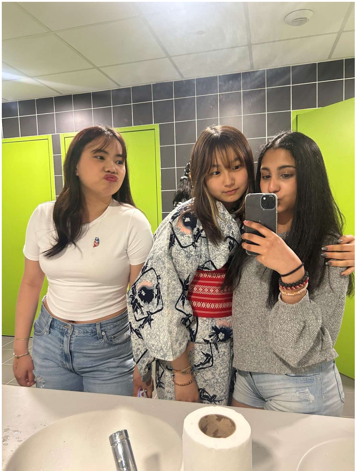
Me and my friends from Taiwan and Japan during our Soirée exotique! (A fun event where students cook a dish from their home country and perform a tradition or song from their culture)