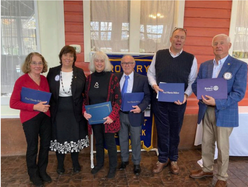
Rotary Club of Lockport