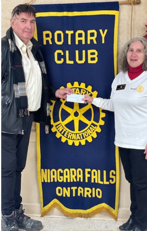
Niagara Falls District Grant completed