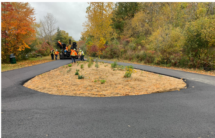
Rotary Club of Norfolk SunriseThree Point Connector, Paving

TRF Chairs Service Chairs Club Treasurers Club Presidents & Elects