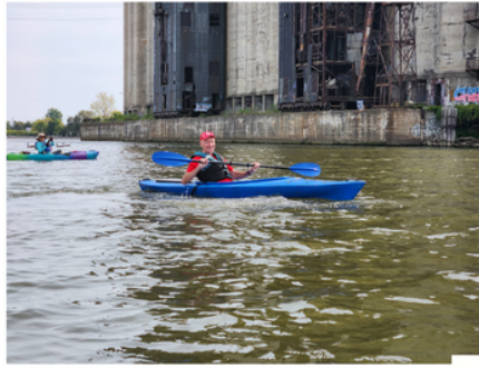
August 24 Mutual Riverfront Park-Buffalo