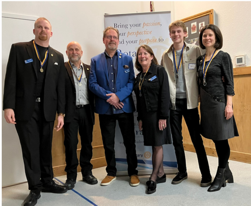
Paul Harris Recipients Rotary Club of Fonthill