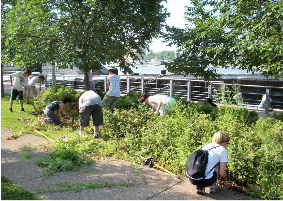
Members of Buffalo area Rotary clubs doing Spring Cleanup at the Buffalo Naval Park

RESOURCES TO HELP OUR CLUBS GROW AND PROSPER