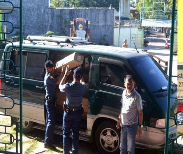
ing of Educational Equipment from the van of PS Floro San Pablo with the assistance of Candelaria Police Officers