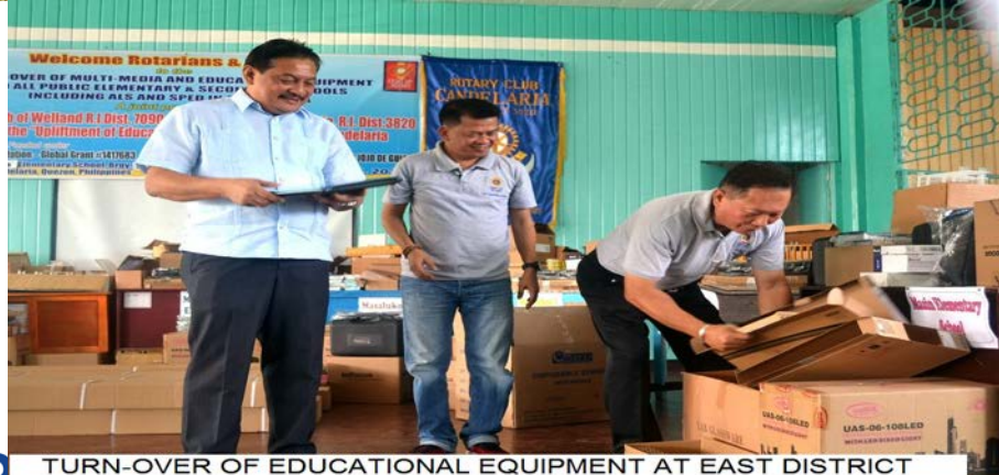
TURN-OVER OF EDUCATIONAL EQUIPMENT AT EAST DISTRICT